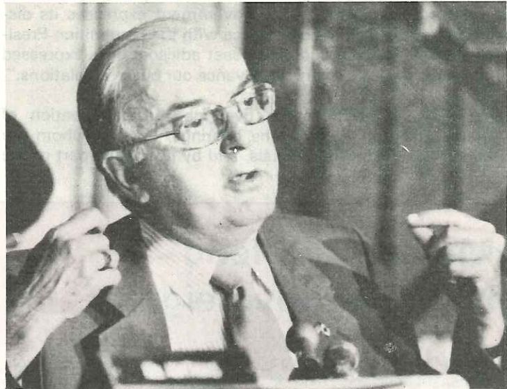
Jesse Helms attacks Mexico from the U.S. Senate.

Lacandon jungle as part of Mexico's participation this year in International Environment Day first instituted by the United Nations on June 5, 1972. The Presidential Decree was the first step toward having the nature reserve, "Sian Ka A'n," declared part of the