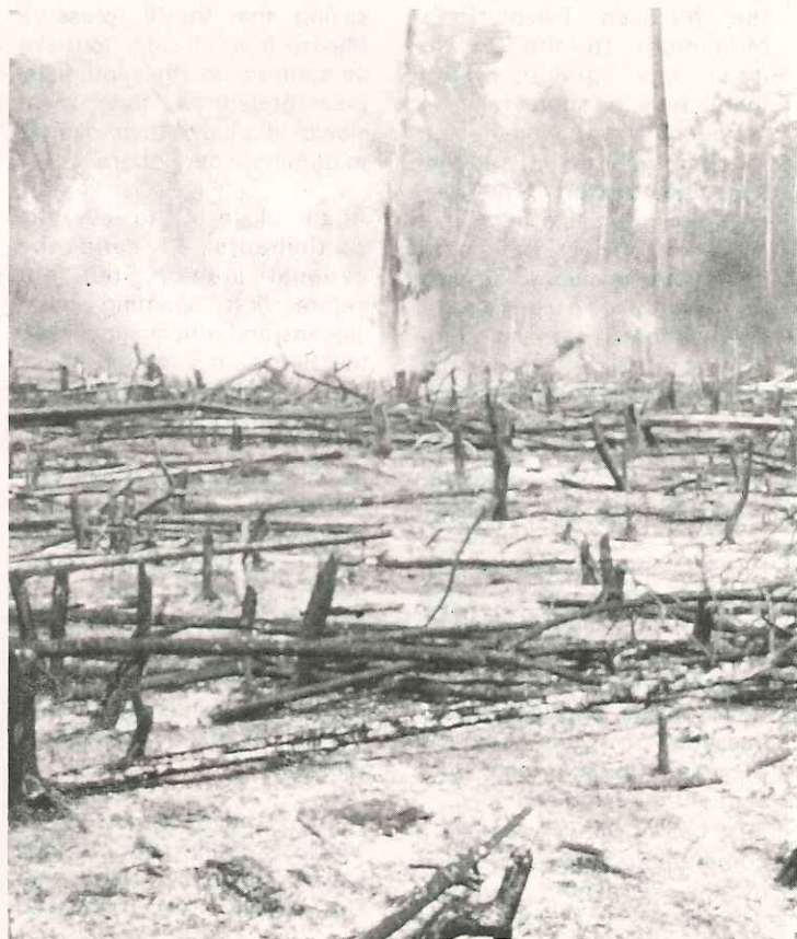
The jungle gives way.