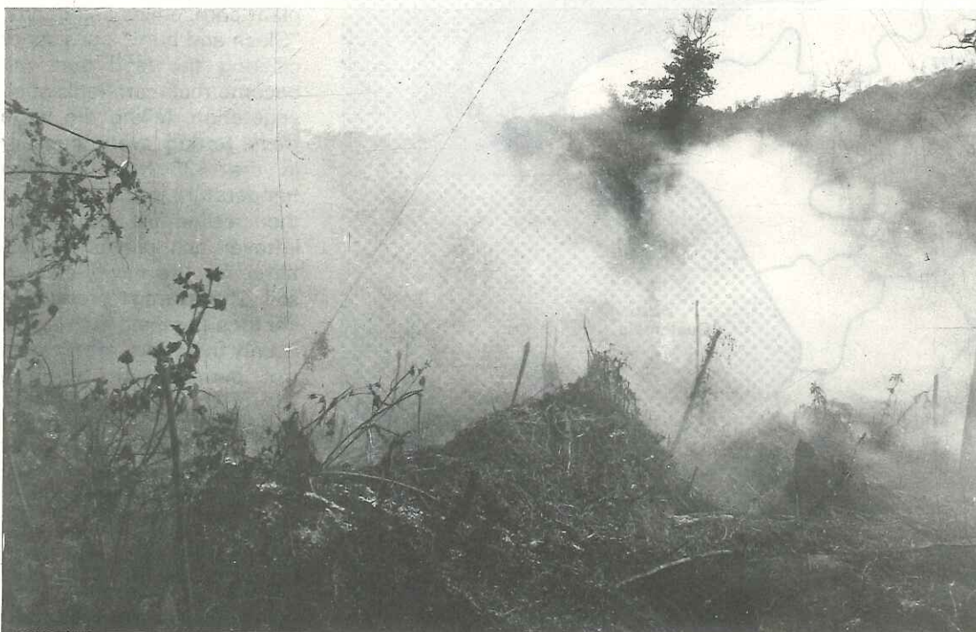
Slash and burn.