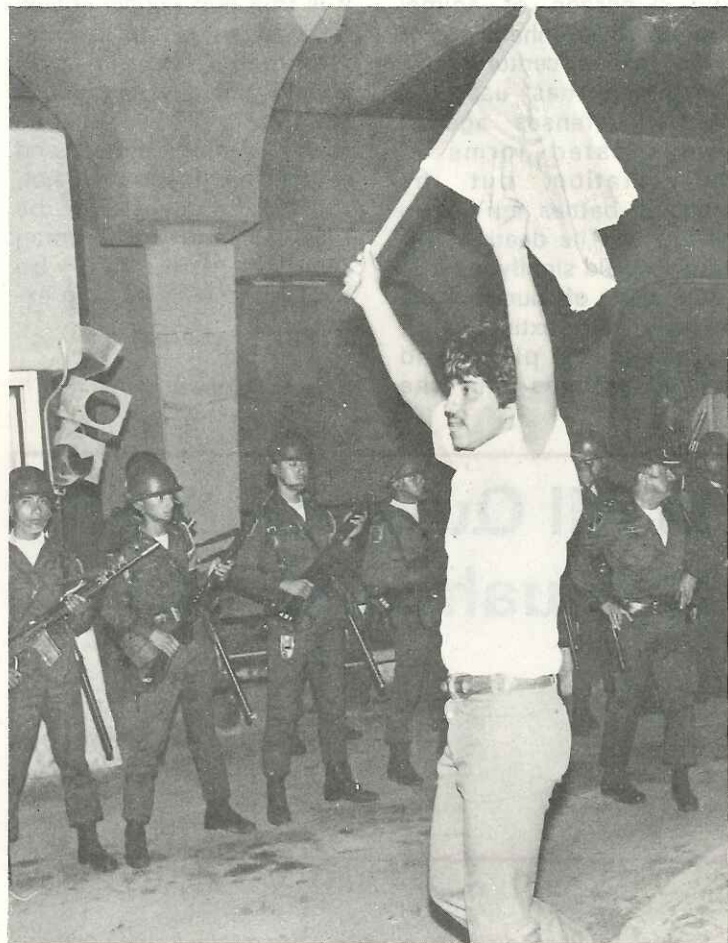
Guarding the border crossing at Ciudad Juárez.