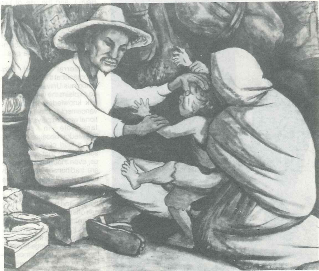
A medicine man as portrayed by painter Diego Rivera.

The doctors became convinced of its curative qualities, and León continued to stock them with the bark. He explains the relatively simple procedure for preparing the powder: "First it is autoclaved at 100 pounds pressure and 80 degrees centigrade. Then it's put in an oven to dry; then