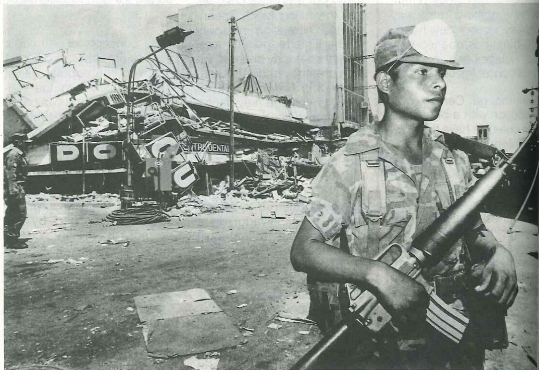
A soldier watching over the ruins of Hotel San Salvador after the earthquake

But it would be wrong to try to analyze the war in El Salvador from the point of view of regular warfare, as a series of clearly defined military fronts and parties deciding the course of the conflict from one battle to another. Thus, for example, Villalobos states that, "...in 1983, despite the fact that the FMLN's military activity placed the government's armed forces in an extremely difficult situation, the absence of an upsurge in mass struggles kept our victories from leading to more significant changes in the relation of forces." An additional new factor that is present today is that, as of last year, there has been a