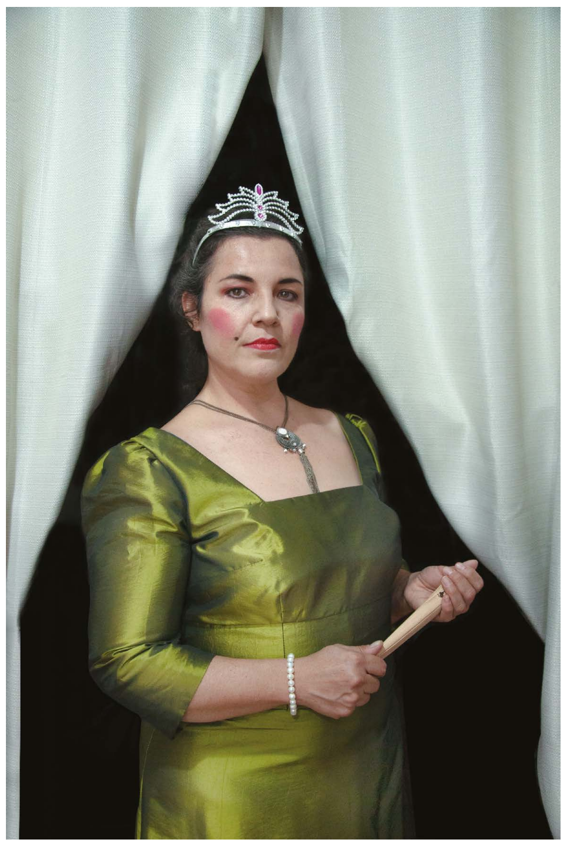
• The Queen is Not Dead: In a self-portrait workshop, one of my tasks was to create an image of my opposite. I chose the nineteenth-century Mexican aristocracy to represent a lineage that's very harmful to us.