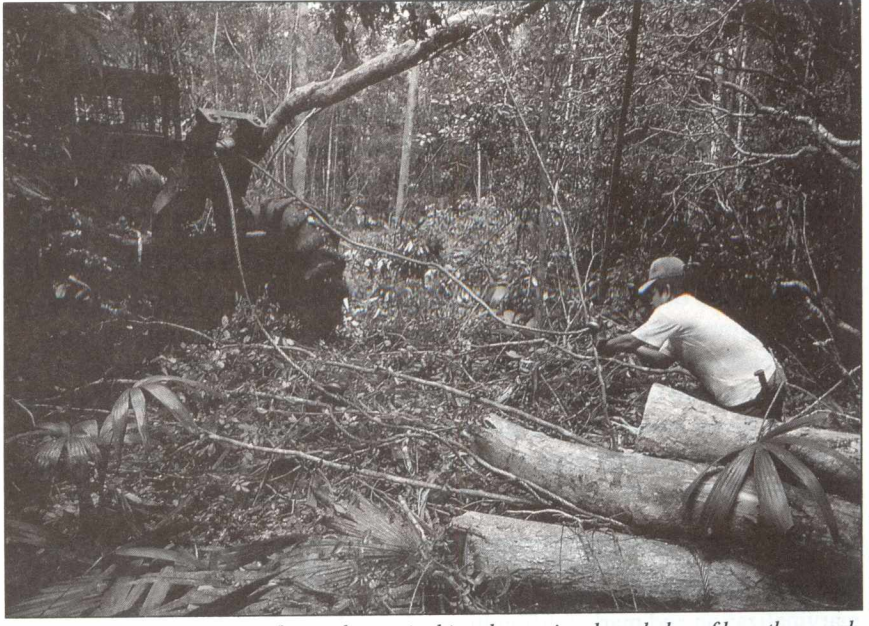
Living in ecosystems as complex as the tropical jungle requires knowledge of how they work.

The 1917 Revolution, the optimistic movement with which Traven's novel ends, did very little to change the conditions of exploitation. Although the properties of several landowners in Porfirio Díaz' time were gradually expropriated, land still tended to be accumulated and the concentration of political power remained intact, as did discrimination against the Indian peoples. The result is that five hundred years after the Conquest, the prevailing situation in Chiapas has a strongly Colonial feel, as though time had stood still in this part of the country.