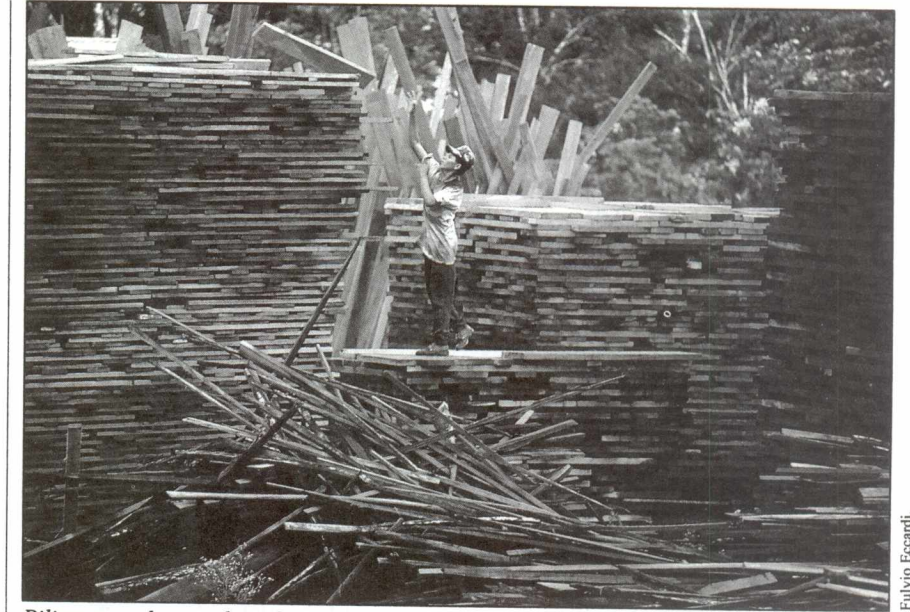
Piling up mahogany boards.

partnerships, "is the lack of a market for the great variety of wood."