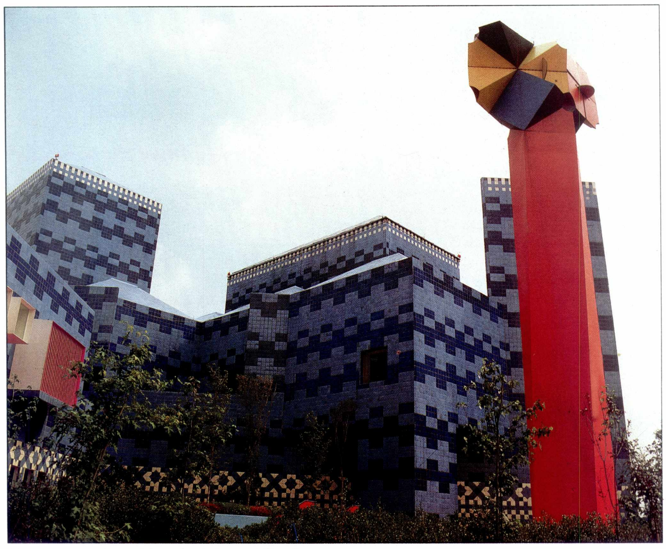
The museum grounds once belonged to the National Glass Factory.

This involves the recognition that human curiosity, the natural urge to investigate, is a search for explanations of the phenomena that surround us. The principle of "learning by doing" has been the source of many of humanity's greatest discoveries.