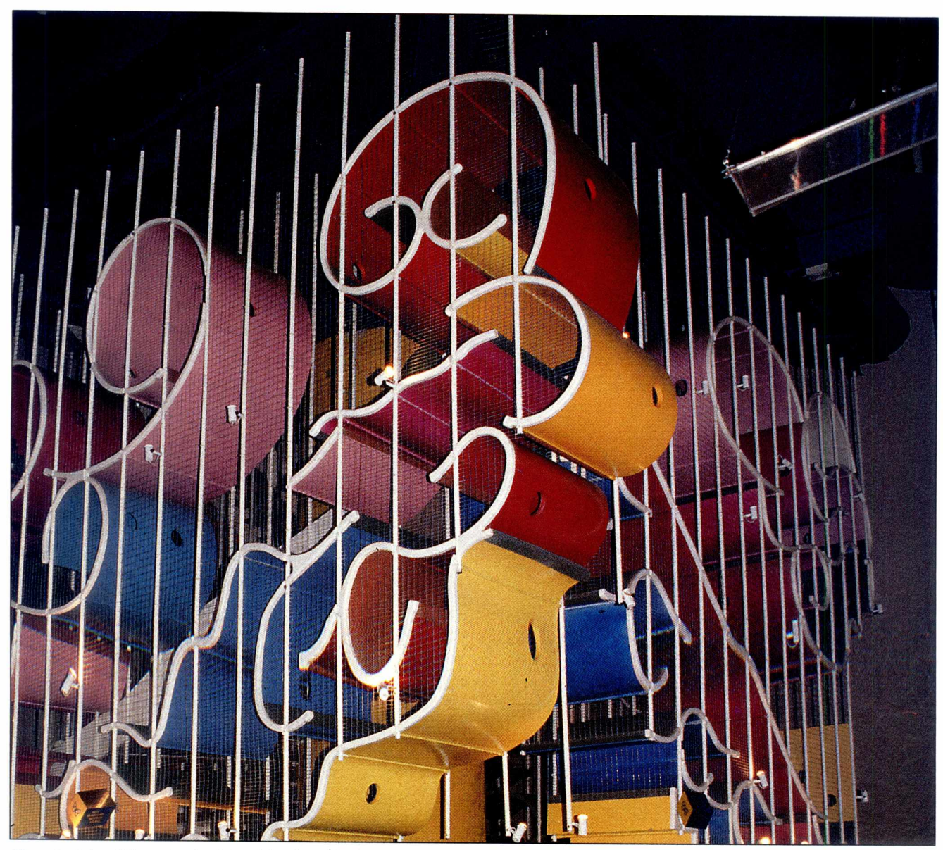
The principle of "learning by doing" has been the source of many of humanity's greatest discoveries.

the content of the exhibits it presents. In addition to displays which use the highest-level technology to explain aspects of universal knowledge, visitors encounter a number of authentically and specifically Mexican cultural expressions.