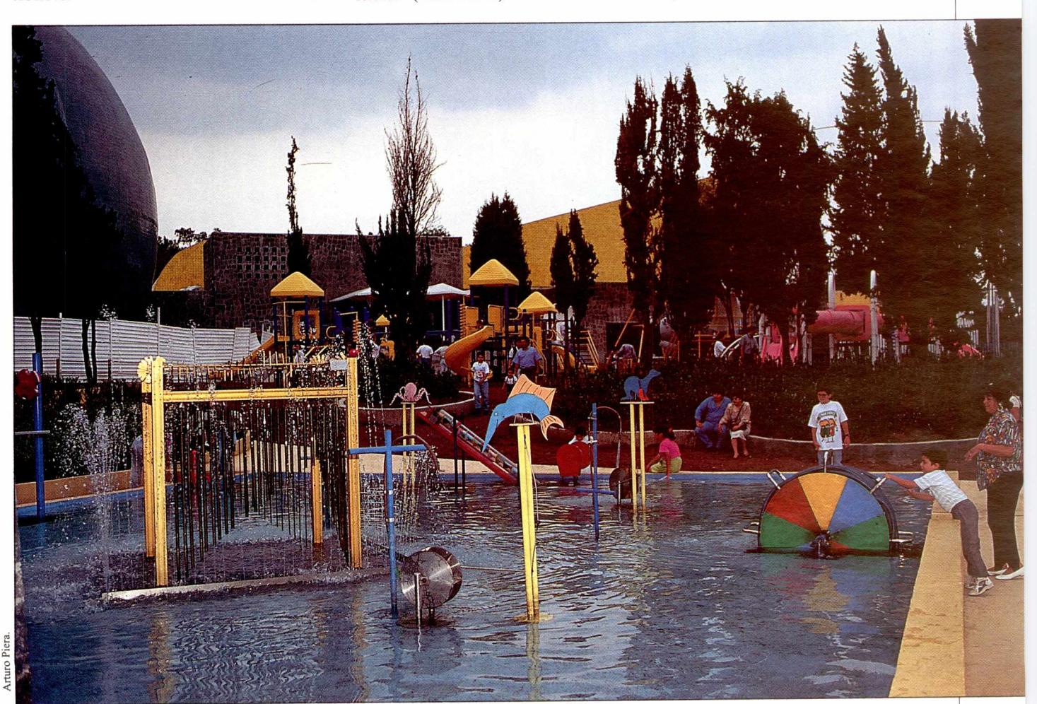
Papalote is a fun way to learn.

Papalote, the Children's Museum, bears the stamp of Mexican culture. An example are the museum's colors, design and architecture, together with