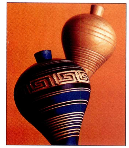
Dancing and spinning, spinning and dancing.

with miniatures, usually on religious themes but also relating to life during the Mexican Revolution. Examples are the replicas of hacienda kitchens with their walls covered in little cooking pots, the stove made of Talavera-style tiles, with a painted flower vase and even a minuscule metate (mortar and stone for grinding spices). There are also satires of death, with a skeleton stabbing somebody with a dagger as his victim laughs.