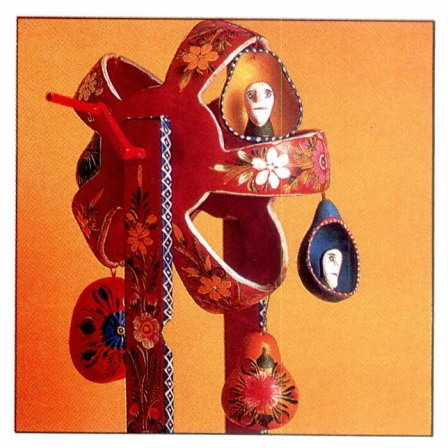
A very Mexican wheel of fortune.