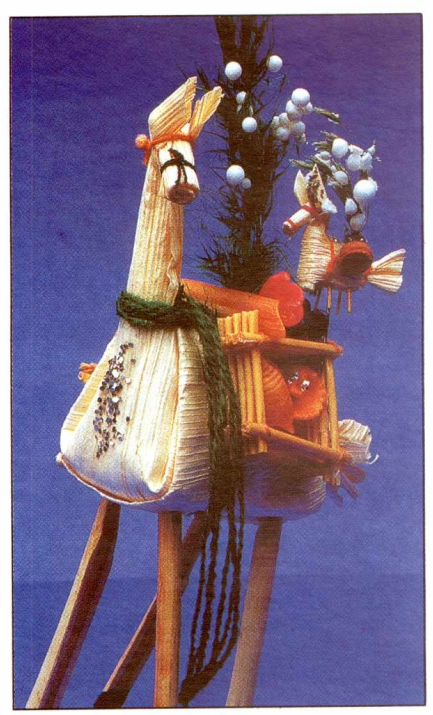
Corpus Thursday mulita.

The Day of the Dead's skeletons, graves and angels turn out to be sweets made from sugar, which children use as toys before eating them. Christmas parties feature little paper lanterns, whistles, flares, small candles, and above all piñatas. Traditional piñatas are shaped like stars, although today many of them are modeled after characters like the Simpsons, the