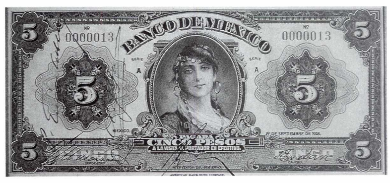
One of the first bills issued by the Banco de México.

above all, inspired by high moral values. The Manuel Gómez Morín Cultural Center, whose tasks include administering the library gathered by the man we commemorate today, was created in that same spirit and with that same vocation. In honoring the university heritage of Gómez Morín, this center was formed autonomously from the ITAM, but that autonomy means union or association rather than a distancing between the two institutions. In line with