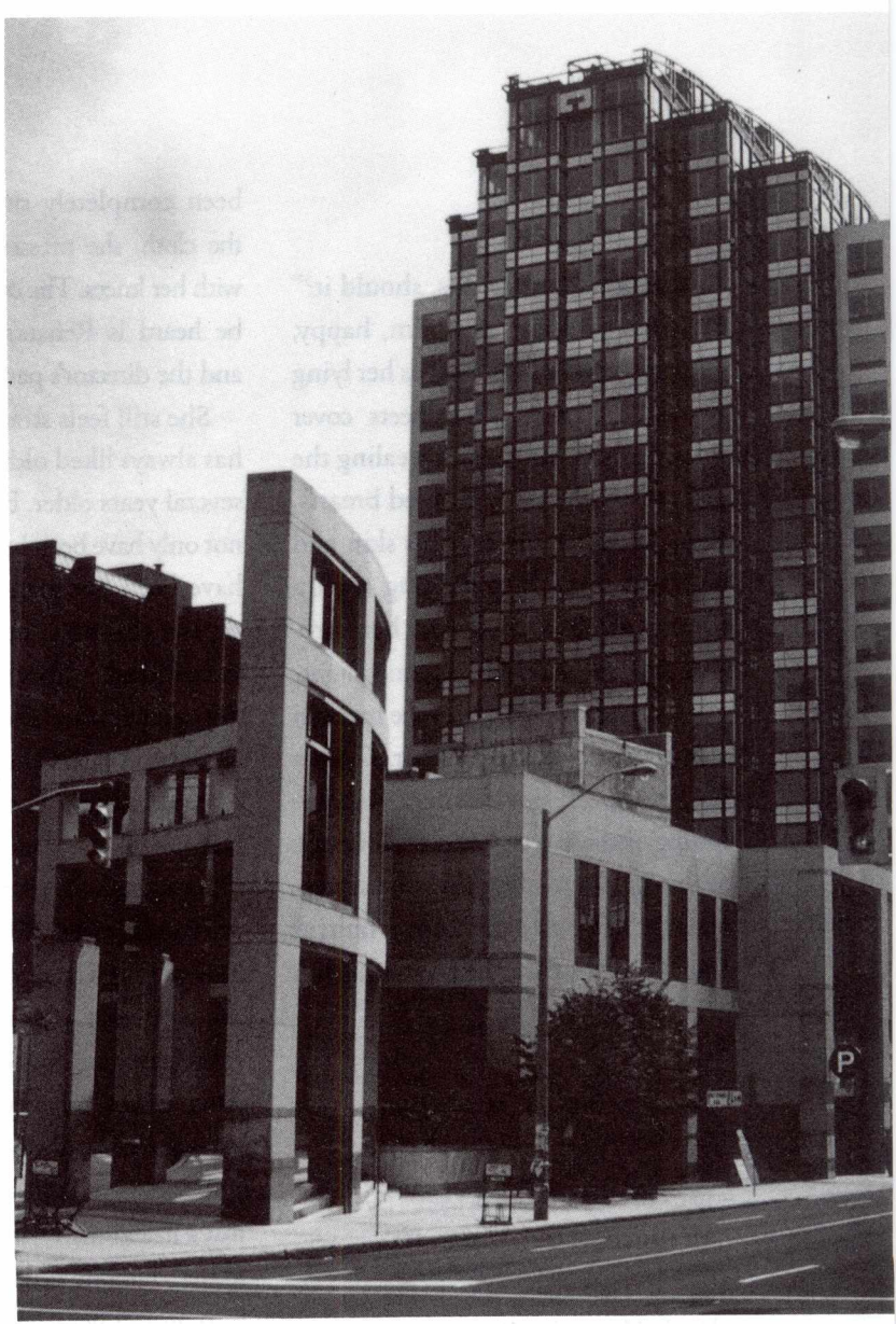
Building where the offices of the Mexican Embassy are located in Ottawa, the capital of Canada.

This way, we will ensure that future generations of Mexicans and Canadians benefit from the opportunities offered by cooperation and democracy.