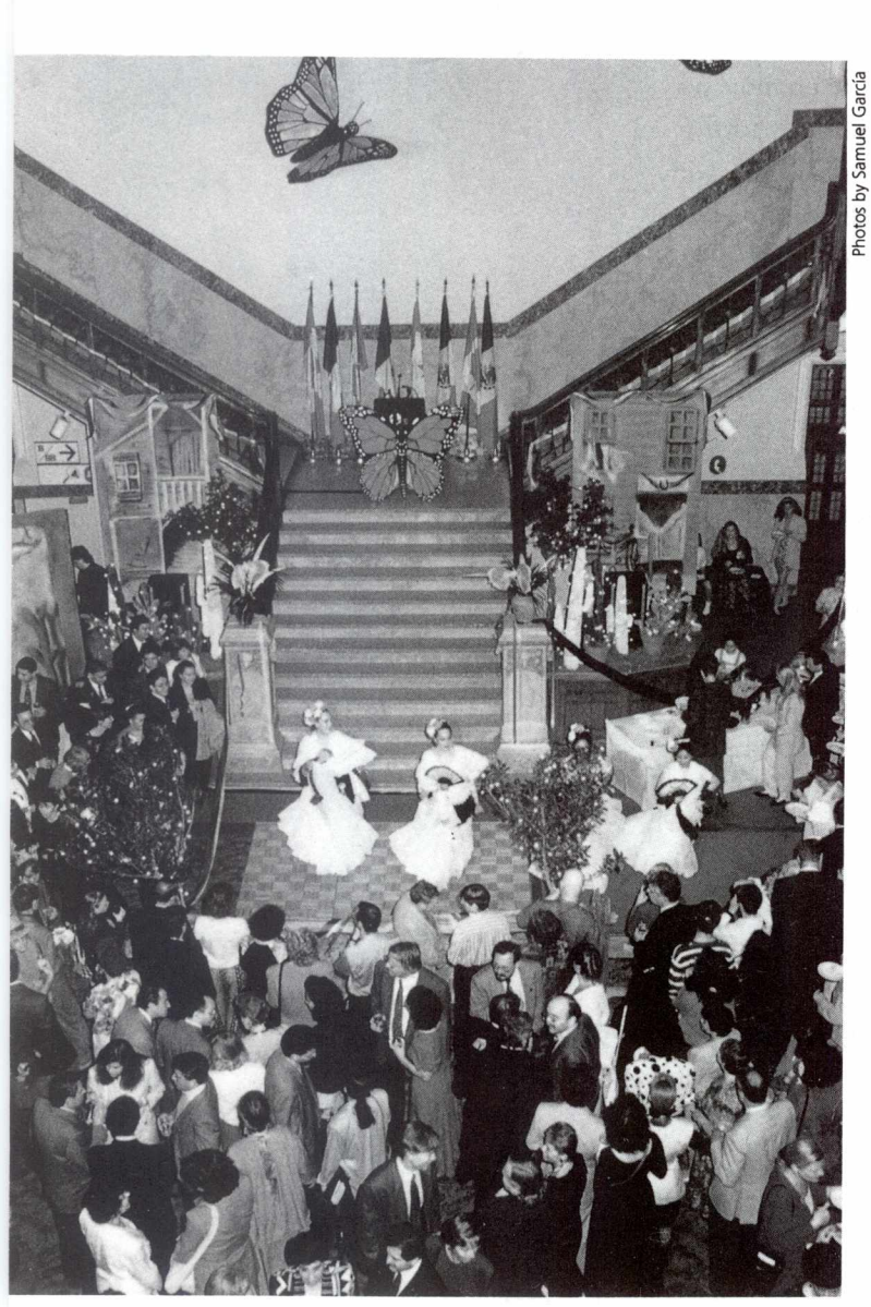
Opening of the exhibition Monarca: Butterfly Beyond Boundaries , at the Canadian Museum of Nature.

he history of the relationship between Mexico and Canada may be short, but it has always been one of respect and understanding. Although Canada and Mexico did not establish diplomatic relations until 1944, the commercial relationship between the two countries goes back to the early years of this century.