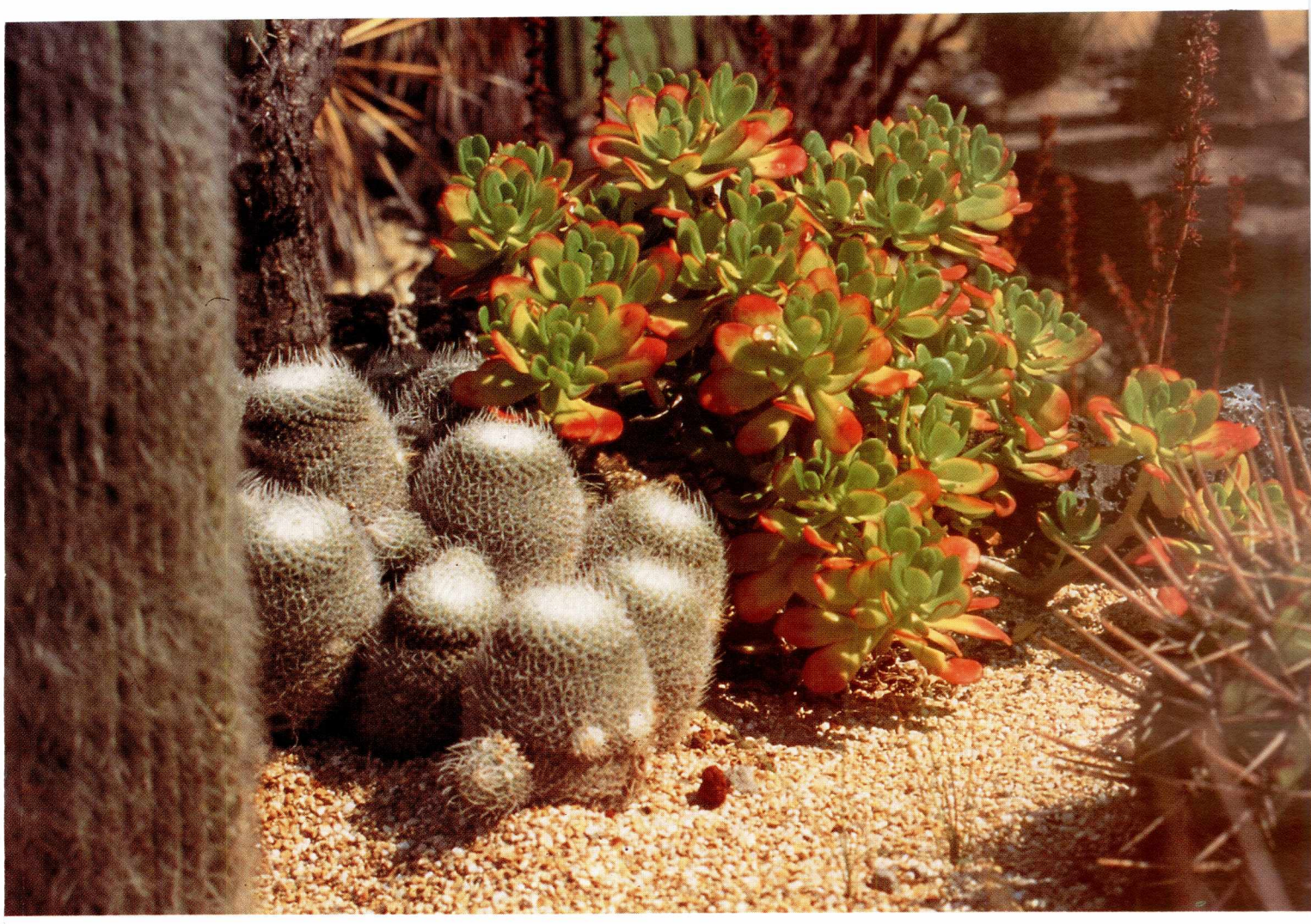
One of the most common uses of cacti is ornamental

These plants were used by men as far back as the first inhabitants of the Americas. Anthropological evidence of their use as food by primitive man has been found at archeological digs in Tehuacán, Puebla, and in the state of Tamaulipas. Cactus stocks, fruit and seeds were part of the diet of the people who inhabited these areas as long ago as 6,500 B.C.