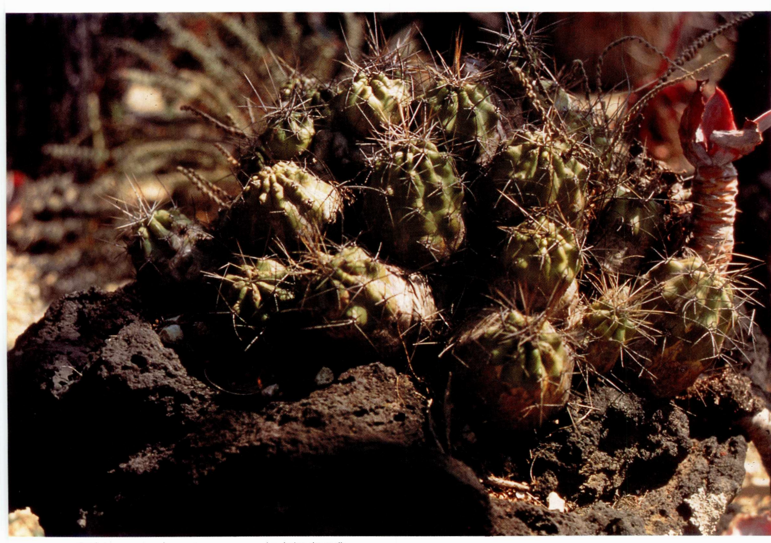
Cacti stems, roots or leaves store water to survive during dry spells.

recent literature about all of the Americas. Estimates classify almost 700 species (nearly 80 percent of all the cacti in the country) as endemic to Mexico; that is, they originate here exclusively.