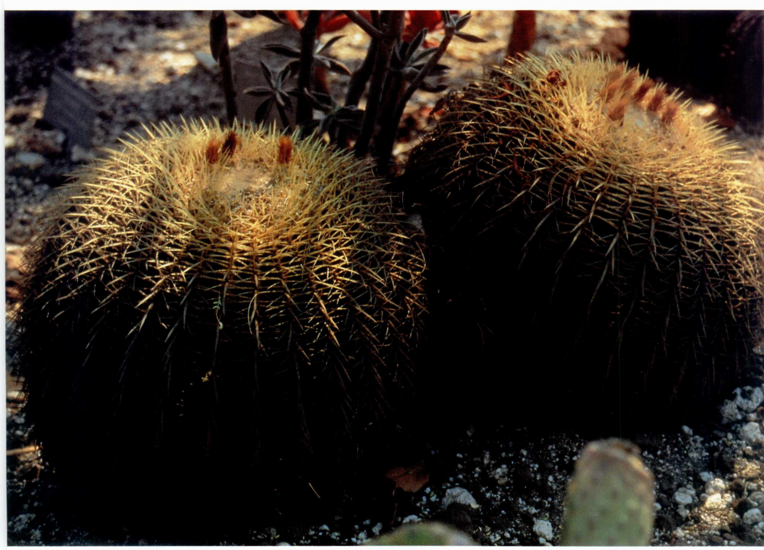
Little pads covered with tiny, light-colored hairs called areolas are cacti's most distinctive feature.

is the nopal (Opuntia ficus-indica, Opuntia megacantha and many hybrids).