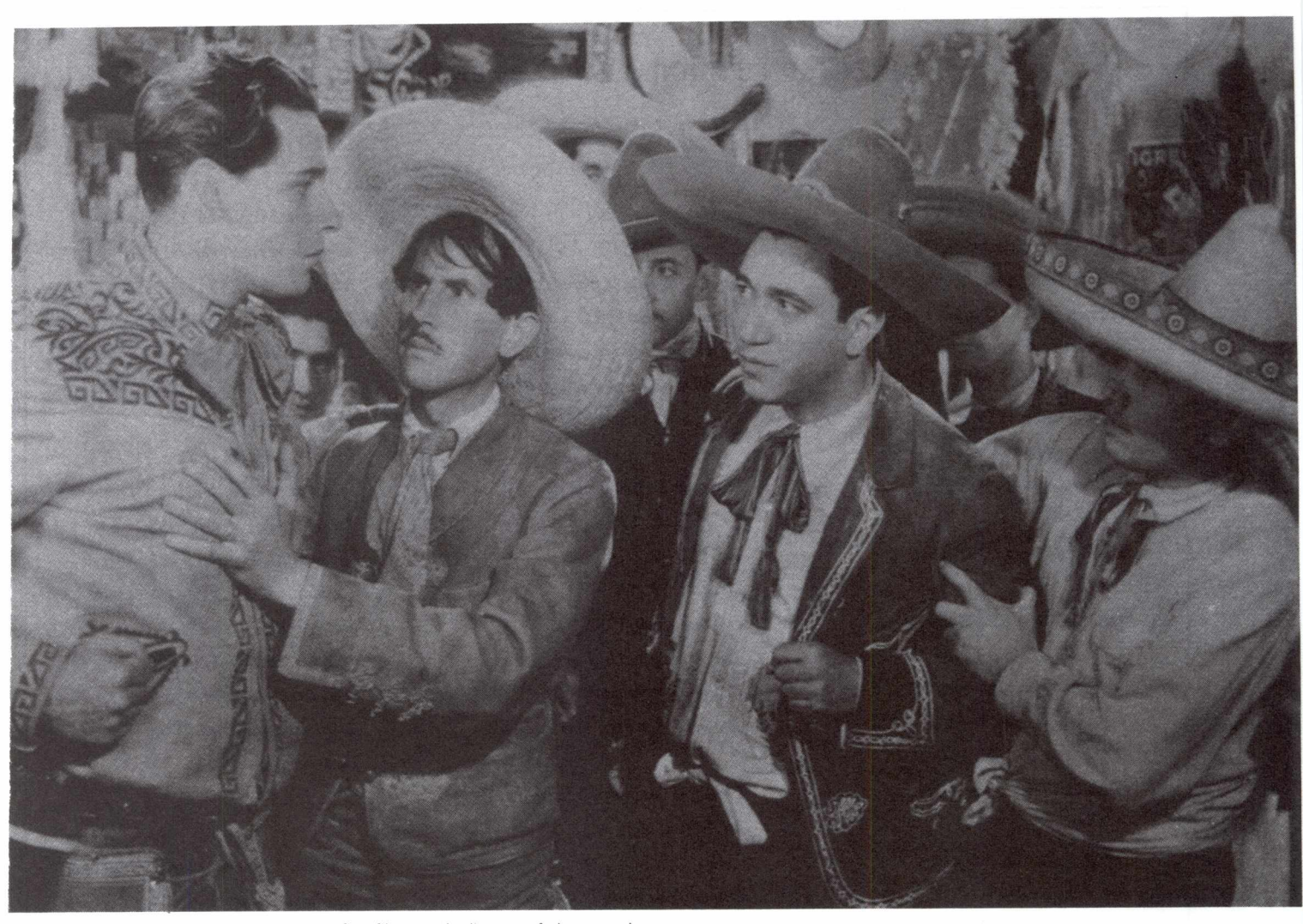
Allá en el Rancho Grande, Figueroa's first film as sole director of photography.

John Huston's Under the Volcano and Don Siegel's Two Mules for Sister Sara are only two examples.