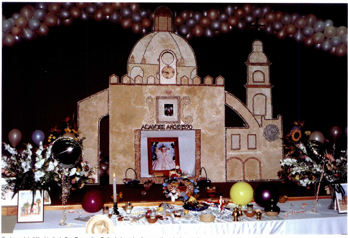
Scale model of Xochimilco's San Bernardino Cathedral, made of amaranth and other seeds.

entire year. It is such a great honor to be steward of the Niño Pa that the post has been reserved in advance until the year 2035. Whomever has been honored with the post must prepare because it requires practically his undivided attention, not to mention enormous expense. When the steward's family is poor, it may have to save for up to 25 years to meet the obligations of hosting and feeding all the visitors to the Niño Pa for a year.