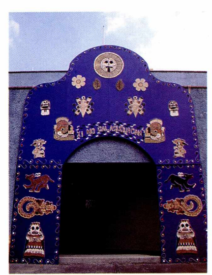
Above: Detail from the portal depicting Mictlantecuhtli, the Lord of Death. Below: The portal at the entrance welcomes the