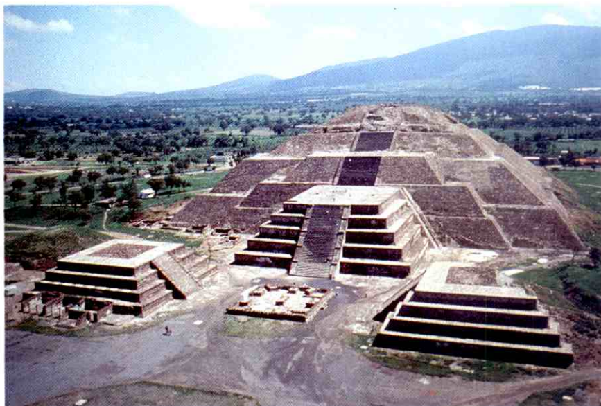
Pyramid of the Moon, main facade. Archeological zone Teotihuacan.