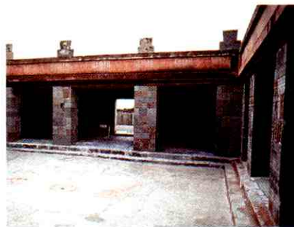
Reconstructed patio and rooms of the Temple of Quetzalpapálotl, Teotihuacan.

Beyond the valleys surrounding the Basin of Mexico, mention should be made of Teotihuacan enclaves distributed along the four cardinal points in areas rich in strategic resources: Kaminaljuyú, the Guatemalan highlands, with the obsidian mines of El Chayal, and which probably supplied Teotihuacan with jadeite and other green stones; Chingú, in the valley of Tula, with its limestone used to make stucco; Maticapan, in the Tuxtla region of Veracruz which probably exported fine clays, cotton blankets, the feathers of exotic birds and jaguar skins; and perhaps sites in Michoacán, like the ones in the area of Tingambato or Tres Cerritos, which may have provided Pacific sea mollusks and Michoacán obsidian.