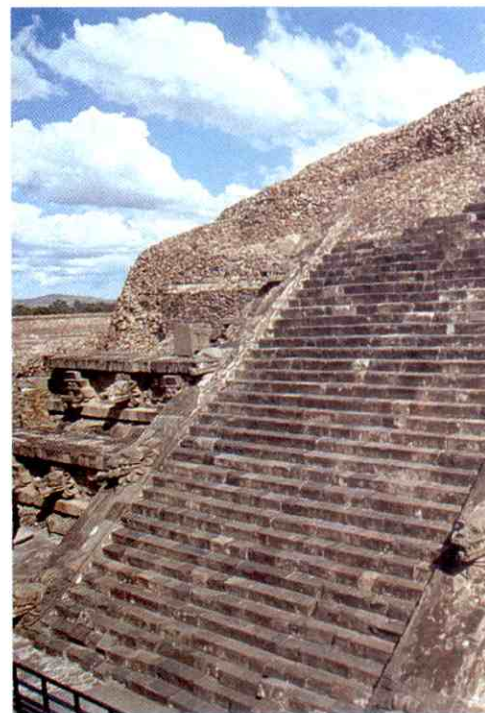
Temple of Quetzalcóatl (detail). Archeological zone, Teotihuacan.

There is evidence that the Teotihuacanos mined resources like cinnabar in the Sierra Gorda mountain range of Querétaro and perhaps in San Luis Potosí, different green stones and serpentine in Guerrero and probably also malachite and other mineral compounds in the Chalchihuites, Zacatecas, area. 10