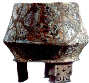
Silhouette cup with crenelated legs, decorated with the figure of Tláloc, Teotihuacan.