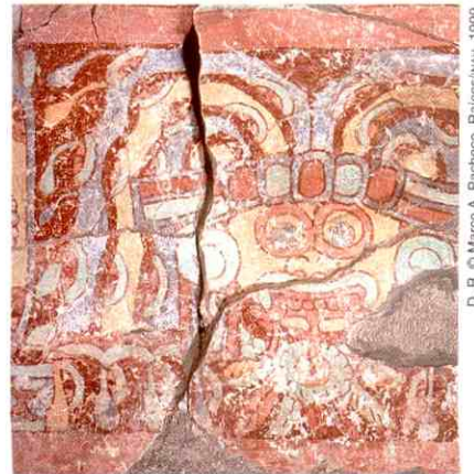
Detail of Mural 2. Portico 2, Tepantitla area, Teotihuacan.