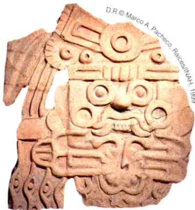
Fragment of a parapet representing Tlaloc. Site Museum, Teotihuacan.

Recently too much emphasis has been placed on the presence of the military in Teotihuacan, 8 but the concrete data available is scarce. For example, scholars point to the more than 200 victims sacrificed at the base of the Temple of Quetzalcóatl as an indicator of militarism. I have criticized this position since, in addition to the fact that it was unique in the history of Teotihuacan, we do not know who those sacrificed were: whether they were from Teotihuacan or not, whether they were from the upper class, warriors, artisans or peasants. Some have said they were weapon-bearing