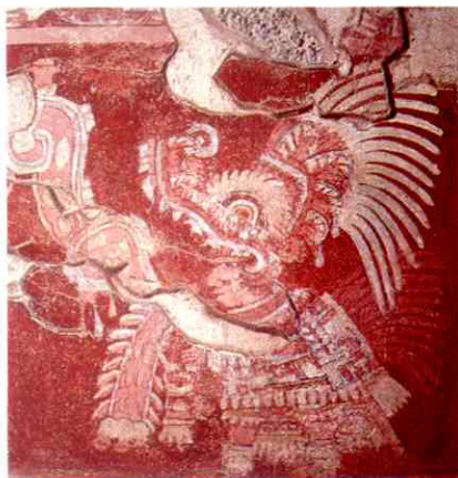
Detail of Mural 2. Patio 2, Tepantitla area, Teotihuacan.