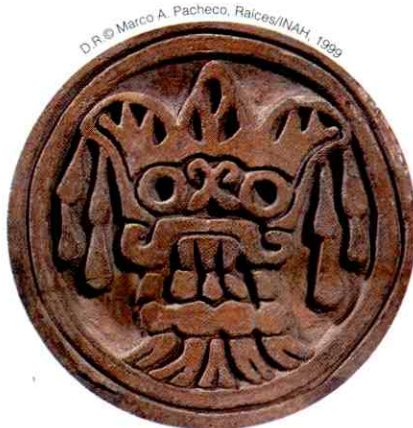
Disk with the face of Tlaloc. Site Museum, Teotihuacan.

Alfredo López Austin conceives of Teotihuacan as the first place where kinship organization was transformed into a state in which the old heads of clans separated themselves into an autonomous group of bureaucrats, administrators and distributors of goods: that is, nobles. 5 The birth of the