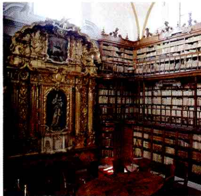
The altar dedicated to Our Lady of Trapana.

Bishop Manuel Fernández de Santa Cruz and His Excellency Francisco Fabián y Fuero, who in addition to donating his personal library, made a gift of those of the Jesuit colleges (the Holy Spirit, San Jerónimo, San Ildefonso, San Ignacio