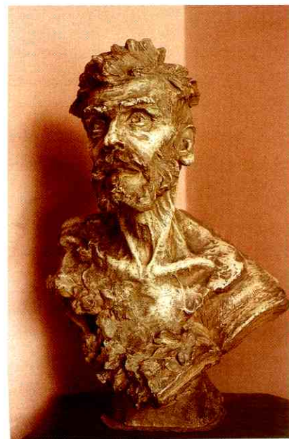
First century B.C. Roman bust.