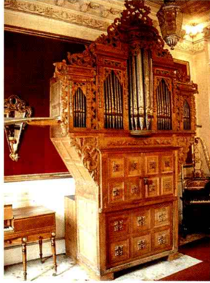
Mexican hand-carved, seventeenth-century organ.

This man’s love for beautiful things finally pushed him out of his own house. The large living rooms and parlors filled up with silks and large china pots, ivories and furniture, sets of dishes and kitchen ware, chests and religious ornaments, until