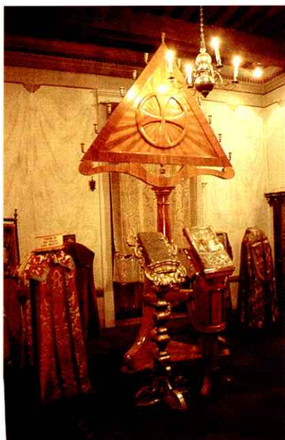
Tenebrario for religious ceremonies.