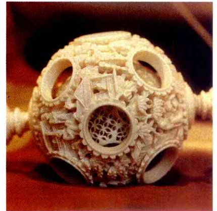
The Spheres of Life , from China, carved in ivory.

Beautiful Mexican, German, Italian, Dutch and Spanish paintings from the sixteenth to the twentieth century hang in the gallery. Continuing our tour, we will happen onto two nativity scenes, one from the Seville School and the other carved in bone by nuns from Puebla. The ivory room displays Asian and European pieces, among them an admirable Chinese work called The Spheres of Life , with concentric spheres carved out of a single piece of material, which required the pa-