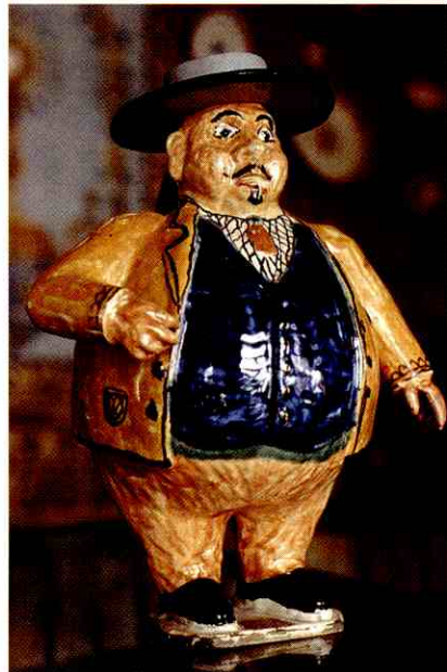
Talavera statue, The Fat Man .