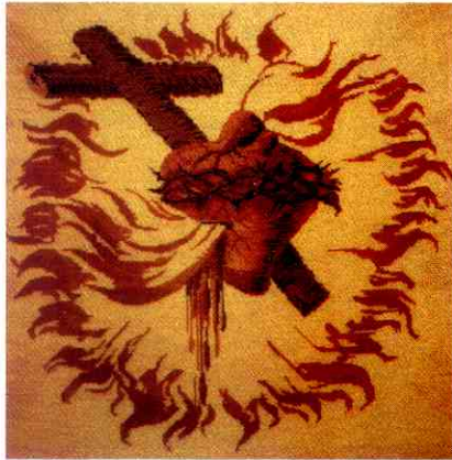
Sacred Heart embroidered by Puebla nuns.

bouquets made of calamine used in churches to adorn the altar. Room five holds one of the world's most complete collections of Puebla Talavera china from its golden age, from the seventeenth to the nineteenth centuries. The pair of angels 1.16 meters high, the fine designs on the blue and white Talavera tub, and the mosaics representing Saint Pascual Bailón, patron saint of cooks, all deserve special attention. The next room contains a large collection of lacquered items from Michoacán and little boxes from the town of Olinalá, Guerrero, framed by an altar hanging embroidered by nuns from Puebla.