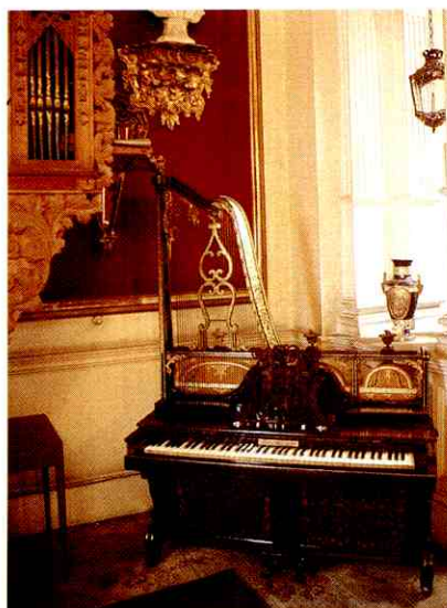
Nineteenth century English vertical string piano.

The three storey building, located in the middle of the historic downtown area of Puebla, is dominated by a central patio.