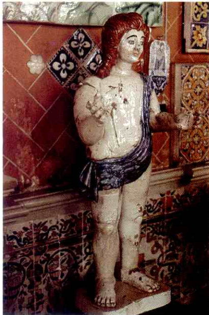
Talavera angel, 116 cm.

Don Mariano Bello died in 1938. As promised, he left his laboriously gathered collection to the Fine Arts Academy, and it was later acquired by the government of the state of Puebla, which opened it as an art museum July 21, 1944. From then until now, the permanent collection has contin-