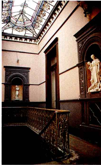
Mexican stained-glass ceiling; Italian marble statues in niches.