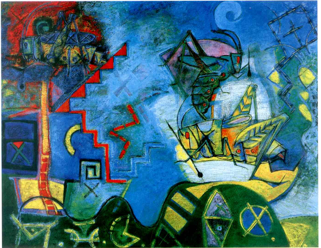
Grasshopper Scribes , 110 x 140 cm (oil on linen).

Zárate has picked his side. It is the side of the whisper and trembling of the forest, of the shining of long banana leaves, of the power of horses and bulls and of the erotic tenderness of women.