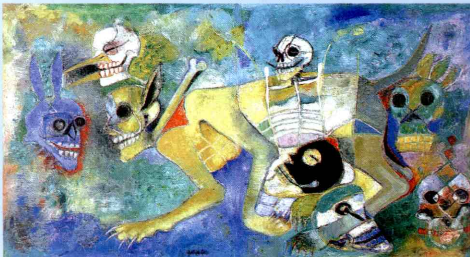
Talking with the Dog , 52 x 93 (oil on linen).