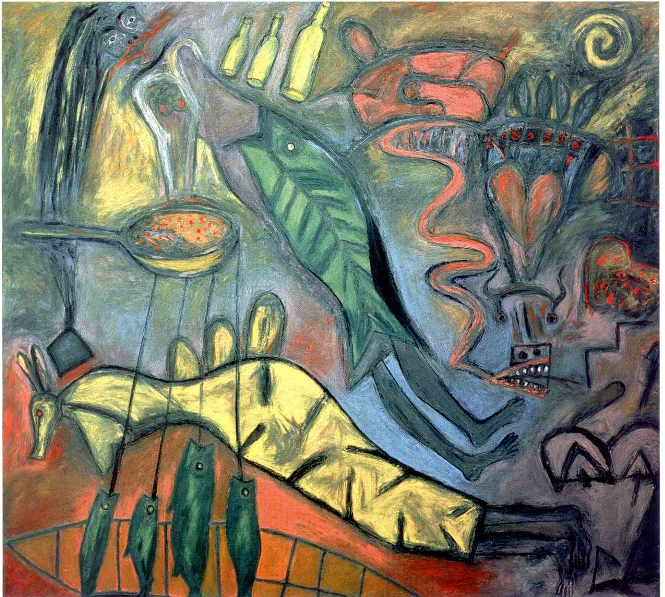
Fish , 188 x 206 cm (oil on linen).

His colors have a sort of savage brilliance, and some of his compositions possess the mystery and magic of the rites and offerings whose timelessness he extends.