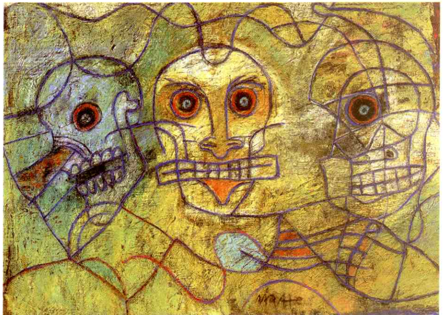
Three Heads , 46 x 65 cm (oil on linen).