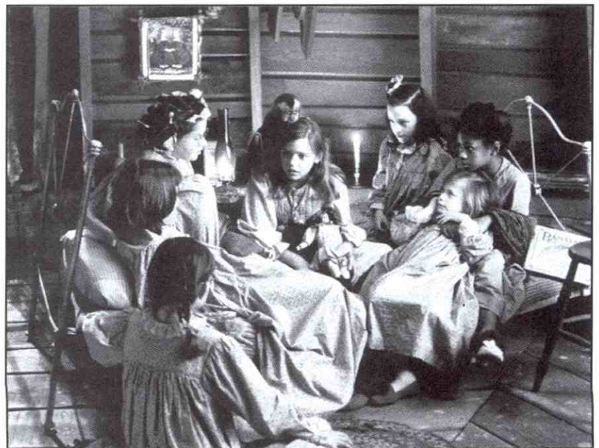
The Little Princess by Alfonso Cuarón (1995).

An obsession with comic books and monsters marked the artist that Del Toro would become before the horror movie magazine, Fangoria , and the music pub-