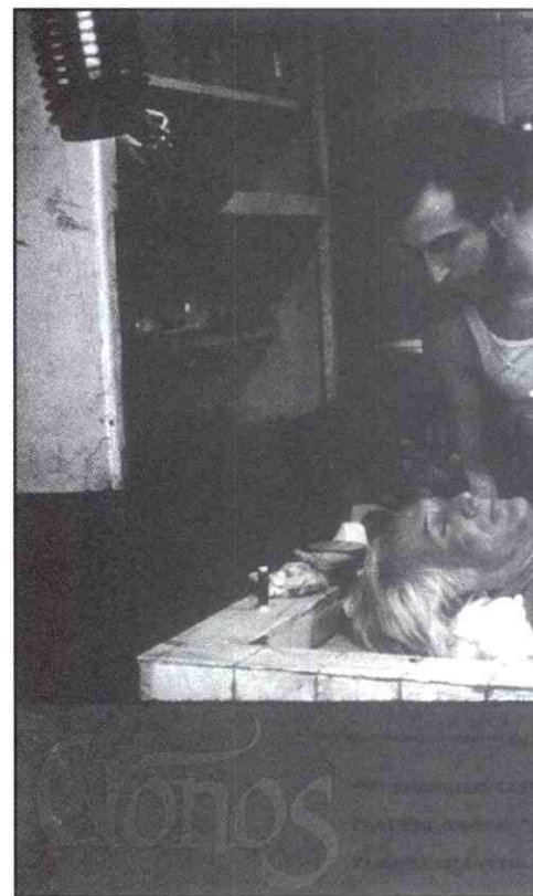
Cronos by Guillermo del Toro (1993).