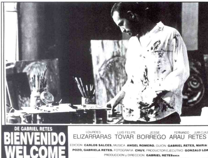
Bienvenido-Welcome by Ignacio Retes (1994).

The Little Princess (1995) made Alfonso Cuarón the most sought after director of the moment.