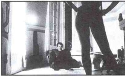
Only with Your Partner by Alfonso Cuarón.