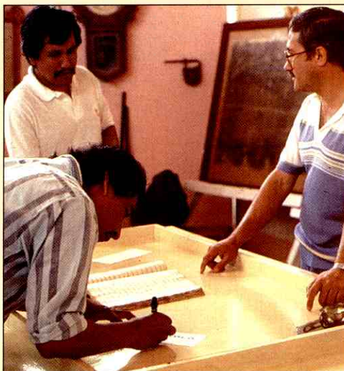
Members of the San Pablo Huixtepec museum's committee preparing an exhibit.

The first is a training center that organizes community workshops, intensive workshops for individual committees and joint workshops for committees and municipal authorities. The second is the Regional Child's Museum, located in Santa Ana del Valle, Tlacolula, the first museum aimed particularly at Oaxaca's children, with the objective of fostering their overall development and strengthening identification with their mother culture.