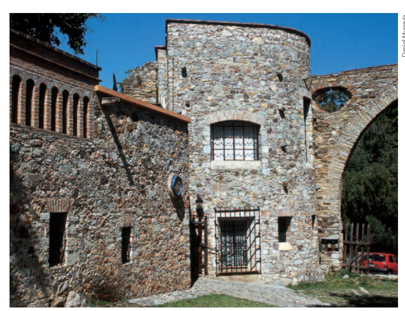
Facade, Olga Costa-José Chávez Morado Museum.

The People's Museum of Guanajuato was opened in 1979 on the initiative of painters José Chávez Morado and Olga Costa.