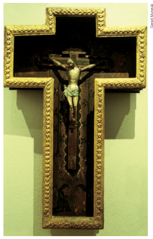
Colonial art from the People's Museum permanent collection.