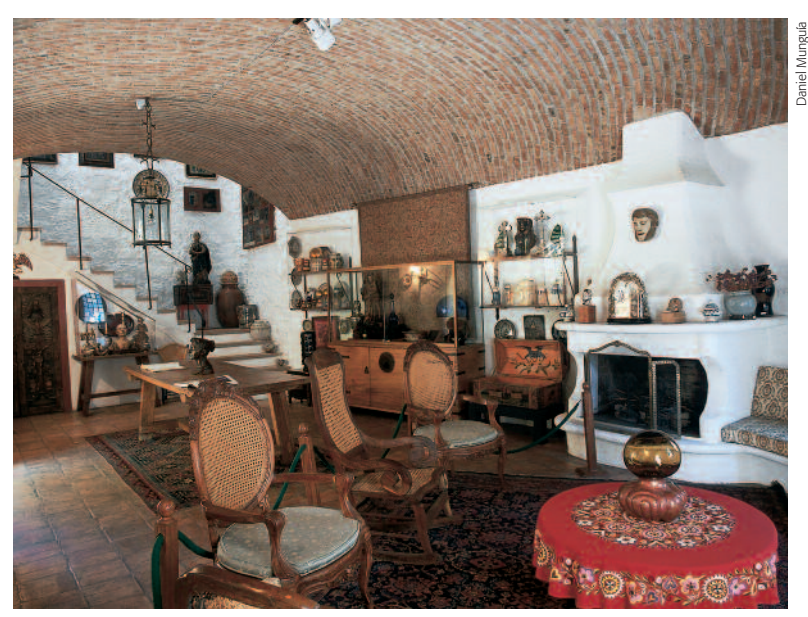
The ground floor of the Olga Costa-José Chávez Morado Museum holds the artists' personal belongings.