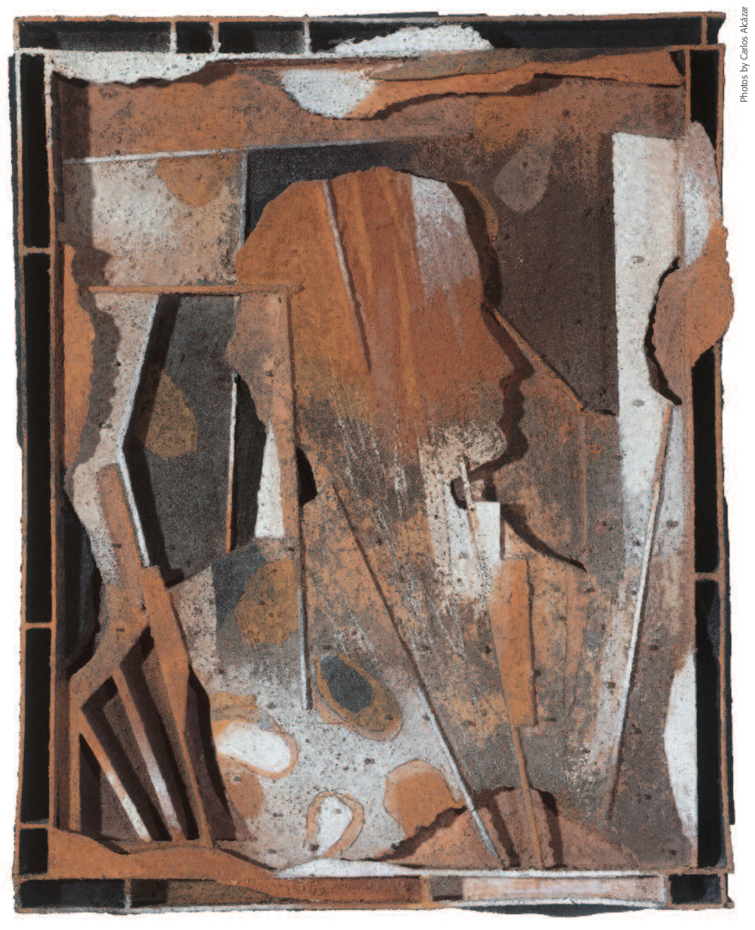
Self-Portrait on the Roof, 70 x 56 cm, 1989 (sand and acrylic).