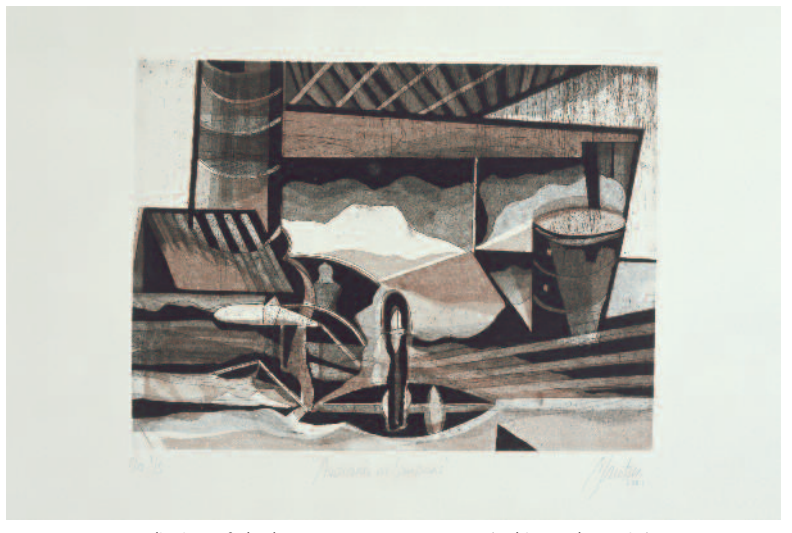
Auditorium of Shadows, 53.3 x 73.4 cm, 2001 (etching and aquatint).

This collaboration, this ancient magical impulse associated with sympathy , is the great absence in a large part of contemporary artis-