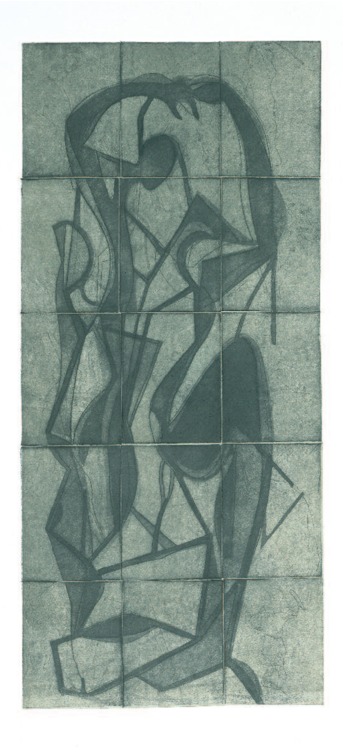
Untitled, 110 x 40.5 cm, 2001 (etching and aquatint).

abriel Macotela's recent painting is a vindication of the genre in today's art world. Its importance is based, like that of all great contemporary painting, on a permanent dialogue with the media and ideas that have brought about its crisis -and even denied it- and with the different cultural codices that have legitimated that crisis. This dialogue has been a constant in the history of great modern painting, of course, and can therefore be taken as an active legacy today, even when there is an attempt to negate it. However, even given this association with the "tradition of the break," its substantiation in the current debate corresponds to very diverse questionings of a radicalism probably previously unknown, in line with the new period that Lipovetzky sees being woven in the vacuum left behind by the end of the age of duty, or that others consider engulfed in a perpetual dynamic of construction, without stable reference points, without final interpreters.