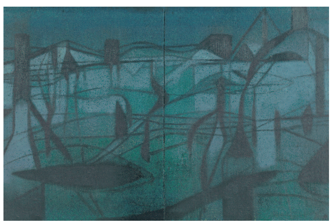
Nocturnal Landscape, 38 x 58 cm, 1999 (oil on canvas).