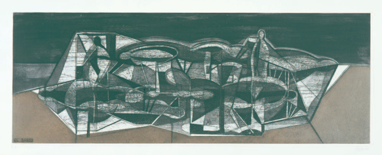
The Boat, 57.2 x 123.6 cm, 1999 (etching).

tic and visual communication discourses associated with the culture of simulation; that is a visual and verbal culture which, in its anxiousness to produce without the concert of the object (which can be reduced to a spot or a simple stroke of the brush), has propitiated this kind of a culture of the vacuum, where signs have become dynamic and ephemeral objects. For that reason, and again in Berger's words, painting today is an "act of resistance that satisfies a generalized need and can create hopes." <sup>2</sup>