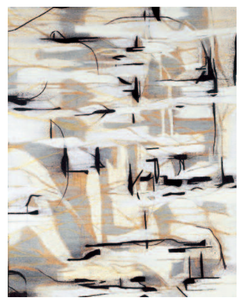
Untitled, detail, 128 x 162 cm, 2001 (oil on canvas).