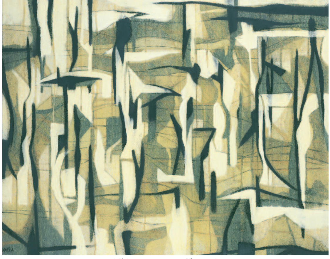
Untitled, 80.3 x 100.3 cm, 2000 (oil on canvas)