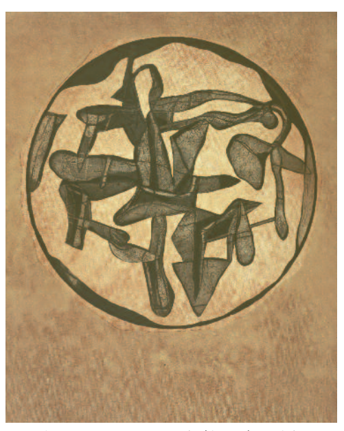
Sun Coin, 100.5 x 76.5 cm, 1997 (etching and aguatint).