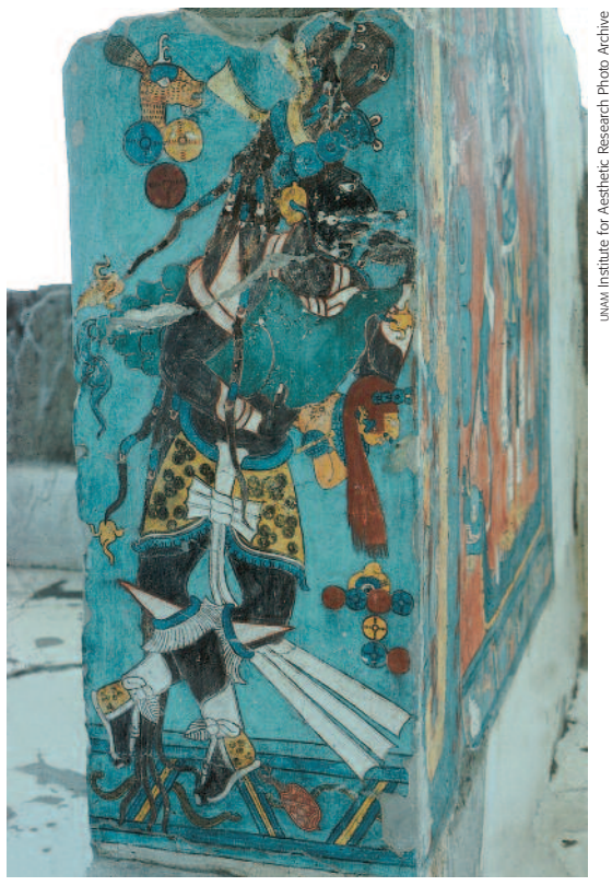
Southern door-jamb of Building A.