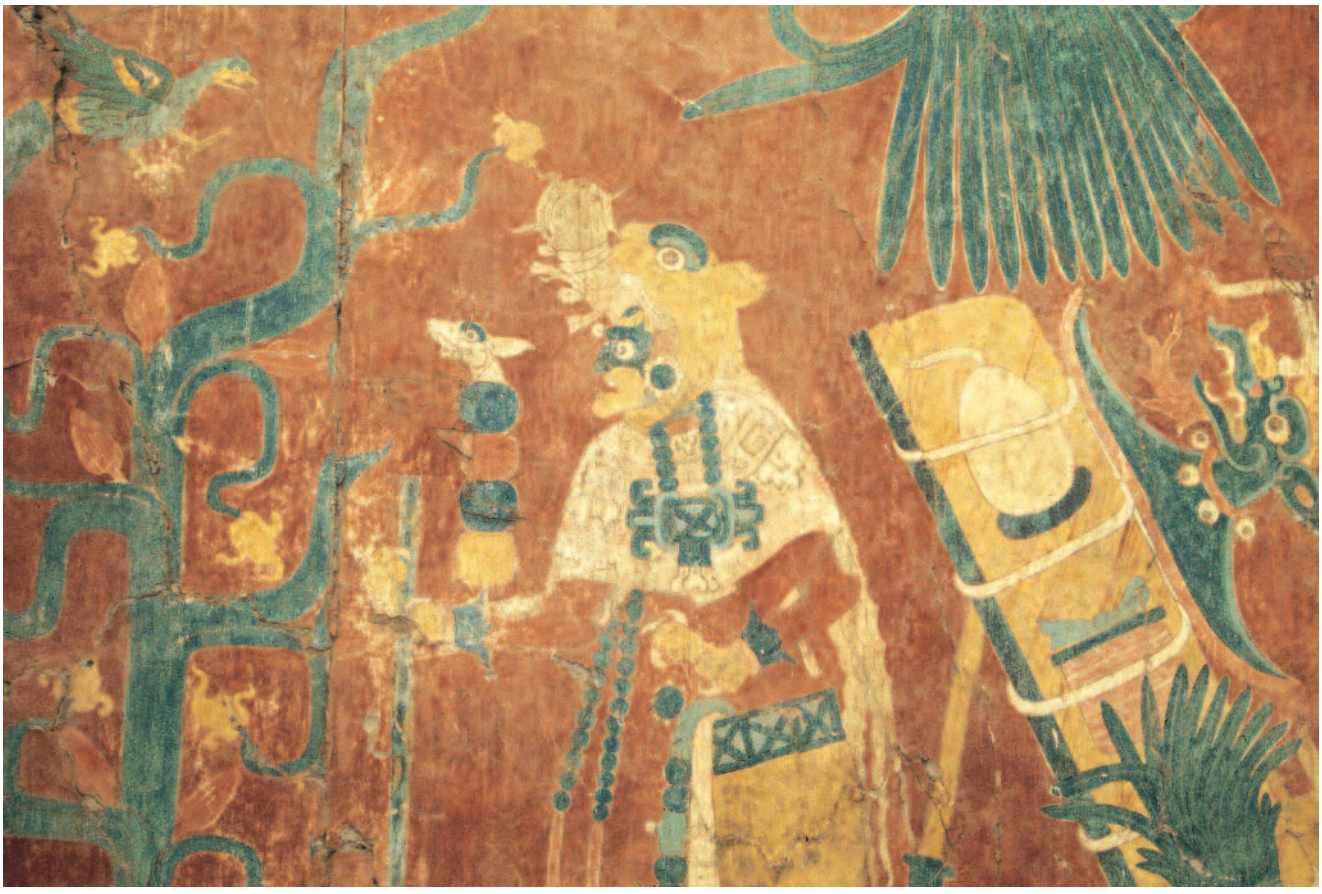
The old man's mask and spiraled eye make him impersonal. Red Temple, east mural.