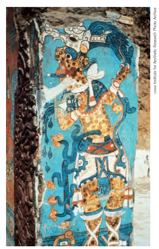
Northern door-jamb of the same building.

or "are born", such as the scales on the fishes and serpents, the plumes on the birds, the shell of the tortoises and the shells of the mollusks and crabs.