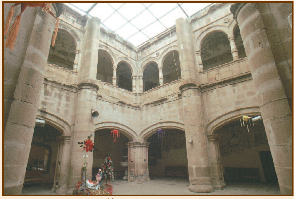
Corner of the cloister, Santiago Monastery, Copándaro.

The task taken on by the mendicant friars in the first few decades of the colonial era ended up by profoundly transforming the indigenous peoples.