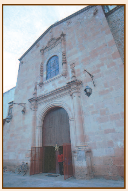
Doorway, Santiago Monastery and Church, Copándaro.