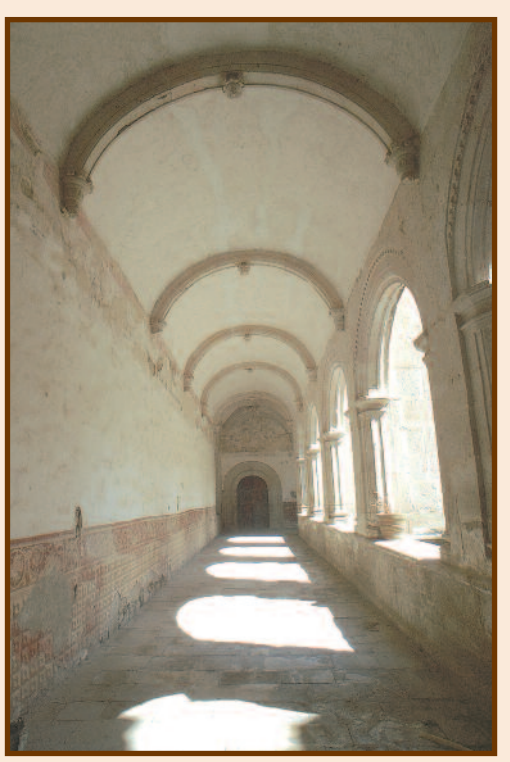
Cloister corridor, Saint Mary Magdalene Monastery, Cuitzeo.