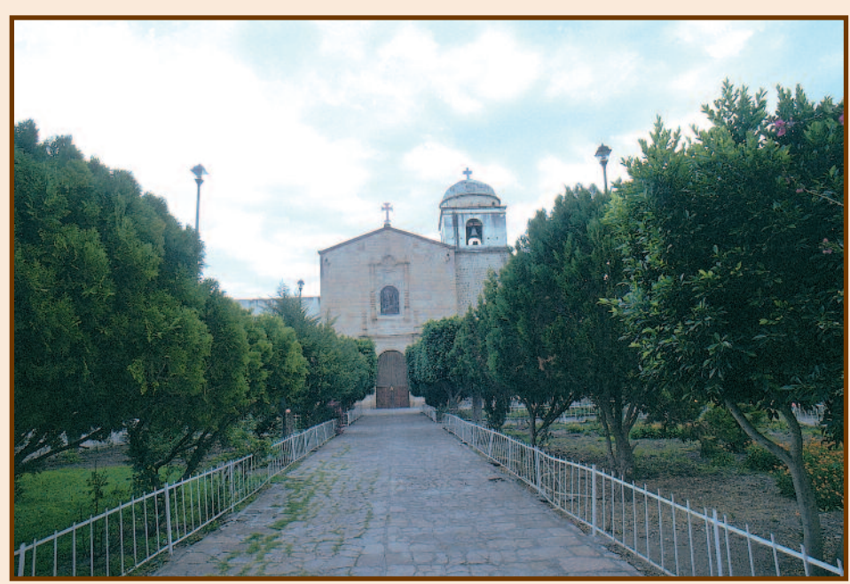
Santiago Church and Monastery, Copándaro.