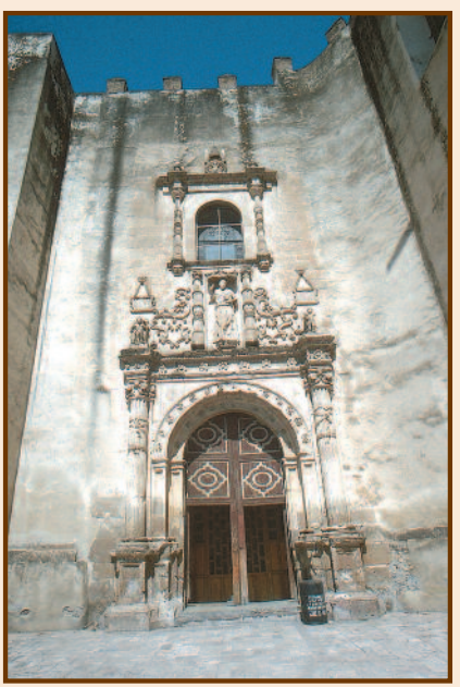
Side door, Saint Paul Church,