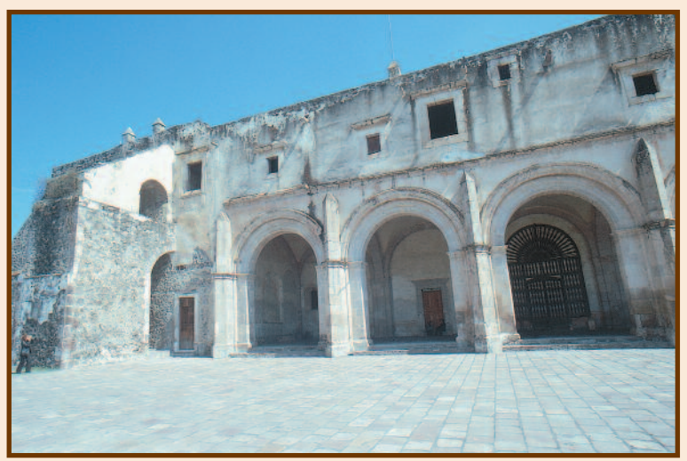
Doorway, Saint Paul's Monastery, Yuriria.

Any description of the architectural virtues of Yuriria's monastery falls short of the building's real beauty.