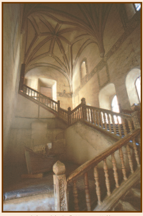
Stairway, Saint Paul's Monastery, Yuriria.

Any description of the architectural virtues of Yuriria's monastery falls short of the building's real beauty.