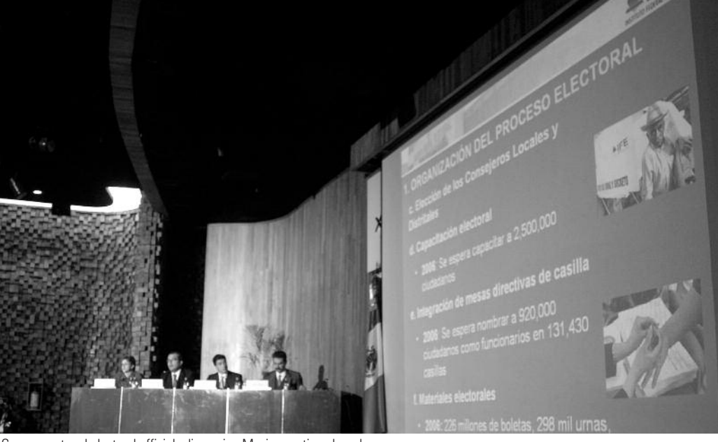
Government and electoral officials discussing Mexican voting abroad.