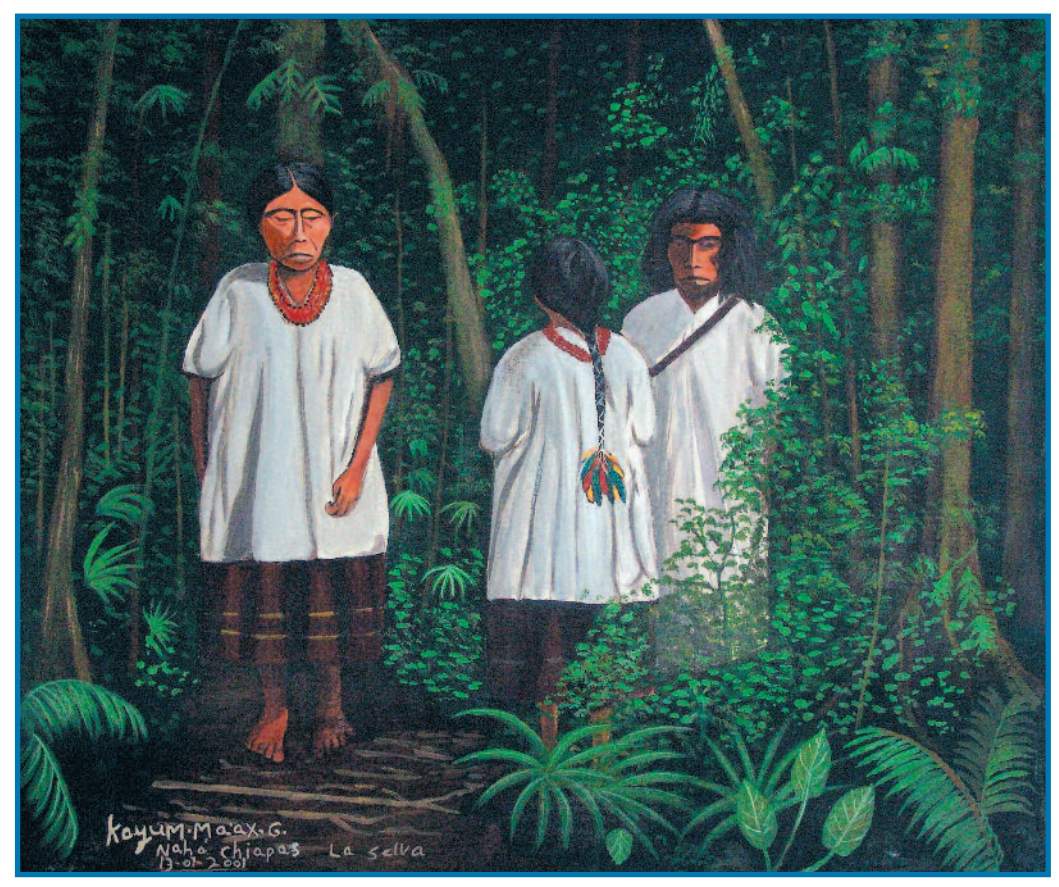
The Hachwinik, Bearers of Tradition, 2001 (acrylic on canvas).