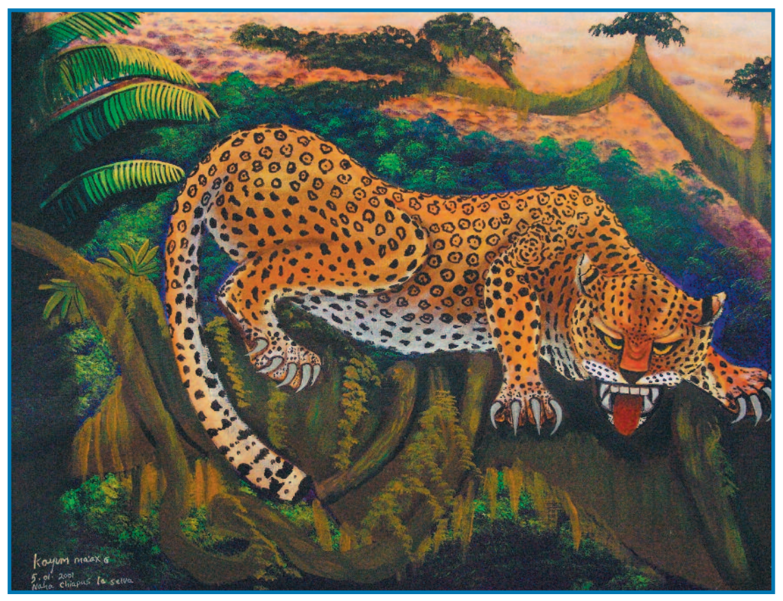
Jaguar of the Jungle, 2001 (acrylic on canvas).

"I paint legends so they can endure as memory. In the painting Birthing , a pregnant woman is about to give birth, she looks for the ceiba or silk-cotton tree. Her labor pains pass into the ceiba somehow and the mother doesn't feel so much pain."