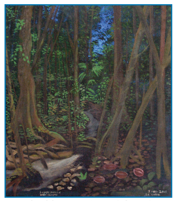
In the Jungle the Stream Never Dries Up, 2001 (acrylic on canvas).