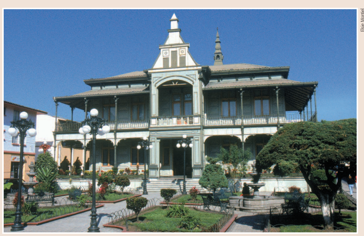
The Iron Palace was brought from Belgium in three ships in the nineteenth century.

rizaba has had many names. The first was of Nahuatl origin, Ahuializapan, meaning "joy on the water." During the time of the conquistador Hernán Cortés, it was called Oricahua or Ahuilicaba. The current name, Orizaba, was first used in 1559. The poet Rafael Delgado called it "rainy"; the populace called it the city of "Our Lady of the Bridges" because of the 37 bridges crossing the Orizaba River. Today, a tour of the river bank includes 13 of those bridges.