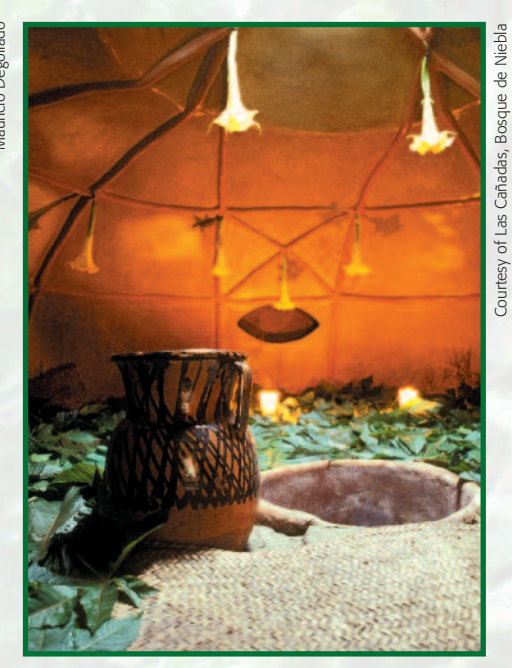
Las Cañadas Cloud Forest