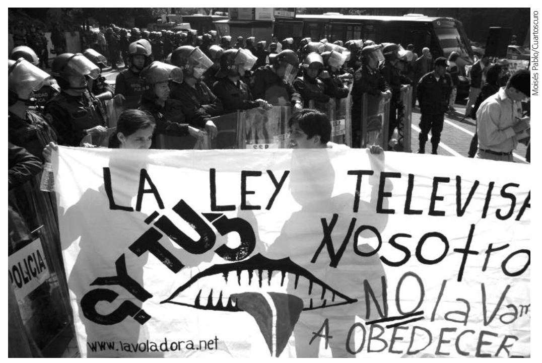
Protest against the new telecommunications law, also known as the "Televisa Law."

In Mexico's new political stage, one of the main issues in the national debate is the future of the broadcast media. This is no chance occurrence: in light of their growing social, economic and political role, they have become a central component not only of existing power relations, but also of the cultural profile of Mexican society. Since they are in