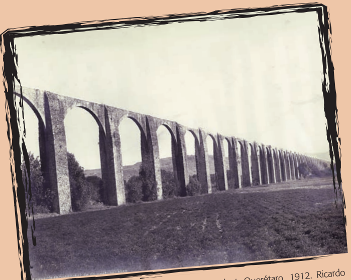
Guillermo Kahlo, Arches of the Querétaro aqueduct, Querétaro, 1912.