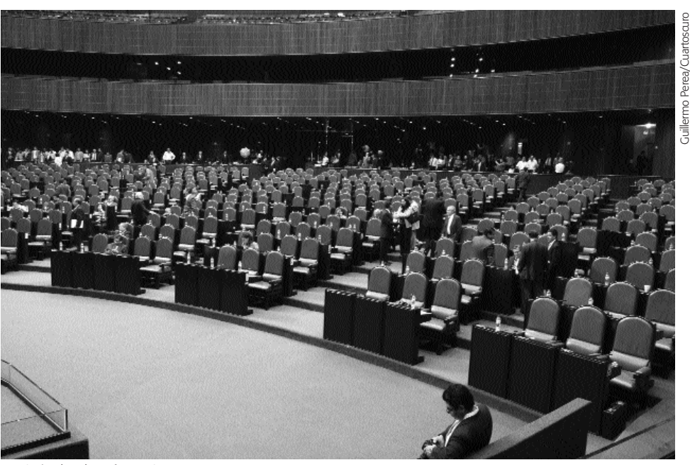
Mexico's Chamber of Deputies.

he Law to Reform the State passed March 29, 2007. Its aim is to establish the mechanisms needed to analyze, negotiate and forge the agreements needed to make it possible to transform Mexican institutions. After a period of consultations, the Congress is now carrying out the debate and negotiations.