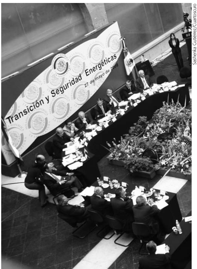
Debating the future of Mexican oil.

bankruptcy. Actually, it has been the result of 25 years of market-oriented policies that have propitiated vertical disintegration, the implementation of a fiscal policy that virtually confiscates the company's resources, a lack of investment in practically all areas of the firm's activity, debt, the practical elimination of technological development as a budget item and surreptitious privatization. Budget and accounting mechanisms deliberately leading Pemex to the brink of a financial crisis have been implemented to justify the need for state capitalization or a legal reform to open it up to private investment. With the aim of overcoming this purported "crisis," the energy reform promotional strategy is based on a