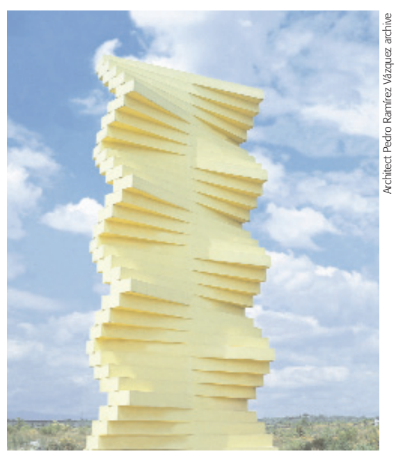
Herbert Bayer, Austria, Articulated Wall (station 13)

Previous page: Angela Gurría, Mexico, Signs (station 1).