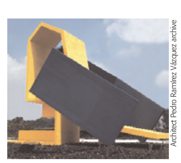
Itzhak Danziger, Israel, Door of Peace (station 15).