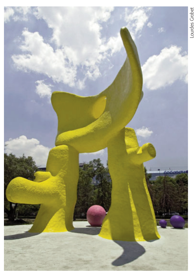
Pierre Székely, France-Hungary, Two-footed Sun (station 5).

THE CHANGE FROM THE SCULPTURAL PARK TO A ROUTE ALONG A FREEWAY MEANT THAT AT LEAST HALF THE ARTISTS PROJECTED THEIR SCULPTURES FOR A VENUE VERY DIFFERENT FROM THE ONE THEY FINALLY ENDED UP WITH.