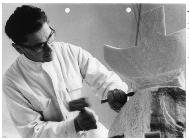
Pierre Székely, France/Hungary, ca. 1967.

THE CHANGE FROM THE SCULPTURAL PARK TO A ROUTE ALONG A FREEWAY MEANT THAT AT LEAST HALF THE ARTISTS PROJECTED THEIR SCULPTURES FOR A VENUE VERY DIFFERENT FROM THE ONE THEY FINALLY ENDED UP WITH.