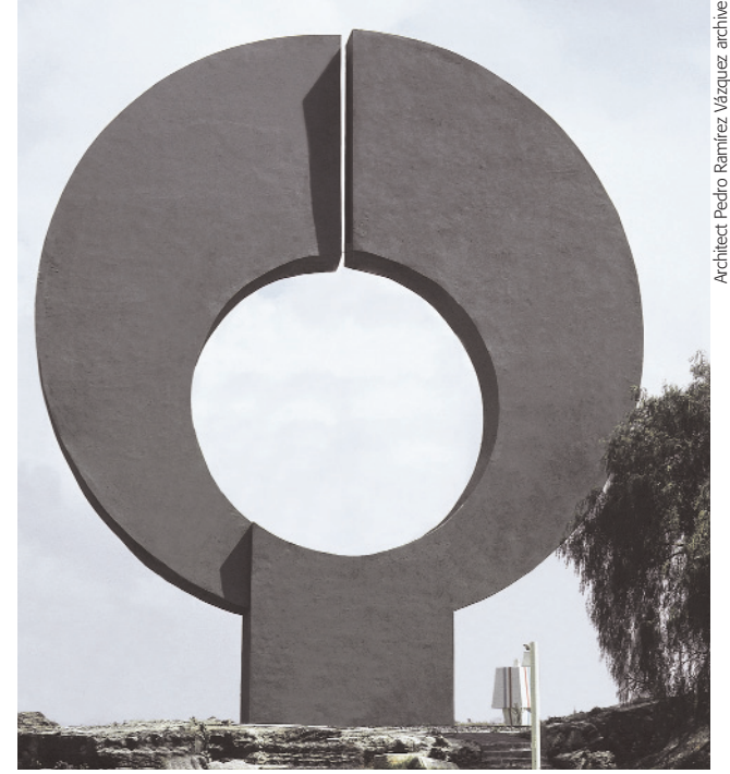
Jacques Moeschal, Belgium, Untitled (station 8).

ACHIEVING MONUMENTAL SCALE WAS ANOTHER DIFFICULT TASH, PARTICULARLY BECAUSE IT IMPLIED HIGH CONSTRUCTION COSTS AND DIFFICULTIES FOR ADAPTING THEM TO THE DIMENSIONS OF THE LOCATION.