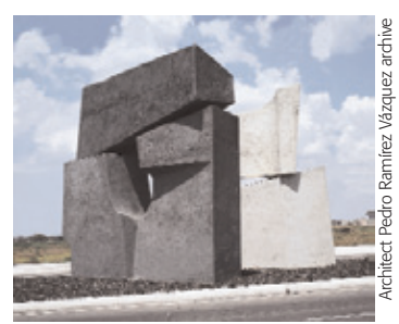
Oliver Seguín, France, Untitled (station 16).