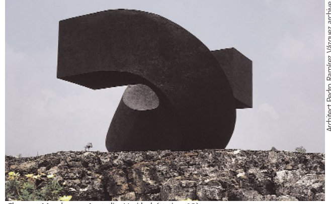
Clement Meadmore, Australia, Untitled (station 12).

ance should be respected and refused to use color. Perhaps for that reason, they were rather austere in the use of color, with a predominance of black, white, yellow and blue.