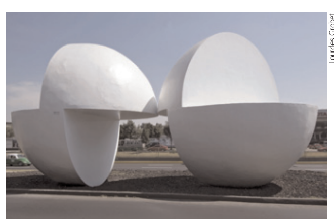
Kioshi Takahashi, Japan, Spheres (station 4)