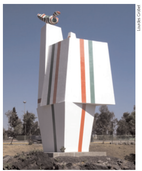
Constantino Nivola, Italy, Man of Peace (station 7).