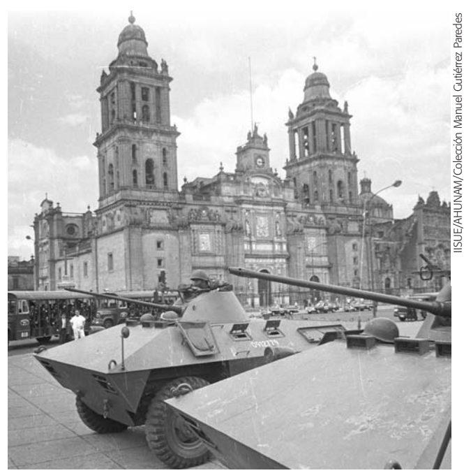
Tanks occupying the center of the city in August 1968.

the fact that about a year ago, the Central Committee of the Communist Party of China allowed itself to thank the Chinese business community for its contribution to growth and development, at the same time that slave labor and other extreme forms of super-exploitation still exist in that country.