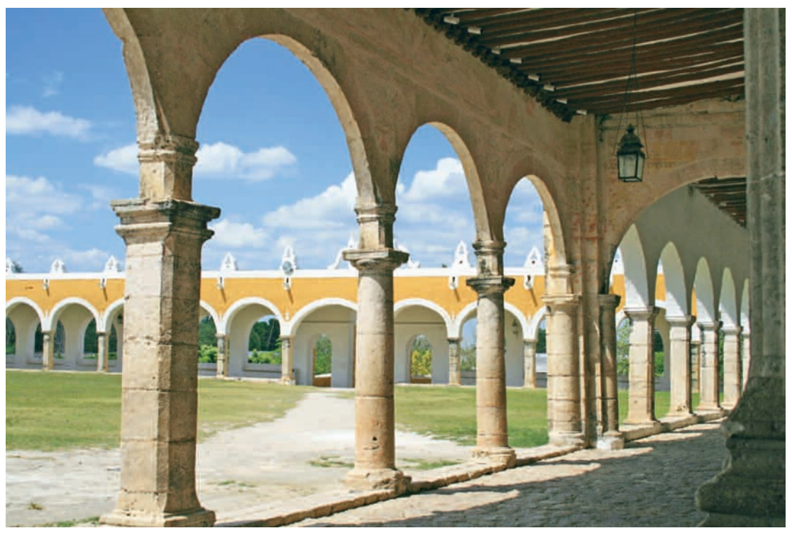
The monastery's atrium is surrounded by a series of extraordinary arches.

ment was raised around the year A.D. 500. Diego de Landa's sixteenth-century description of the building corresponds very precisely to the vestiges found during the excavations.