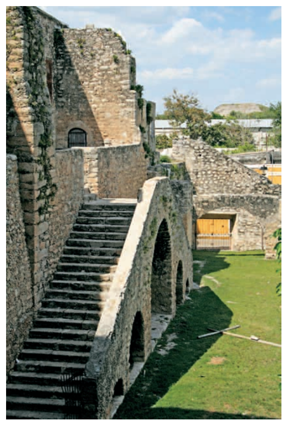
View of the Kinich Kak Moo from the back of the monastery.

The Franciscan Monastery. On the south side of the great plaza was the P'ap'hol-cháak. According to the chronicles, this was the highest building in the pre-Hispanic city. Today, only some parts of the old walls from that time are visible. The Franciscans took advantage of the fact that this basement was surrounded by several plazas to build one of the most important monasteries in the Yucatán peninsula there, giving the lay-out of the colonial city its very own flavor and great presence to the building itself.