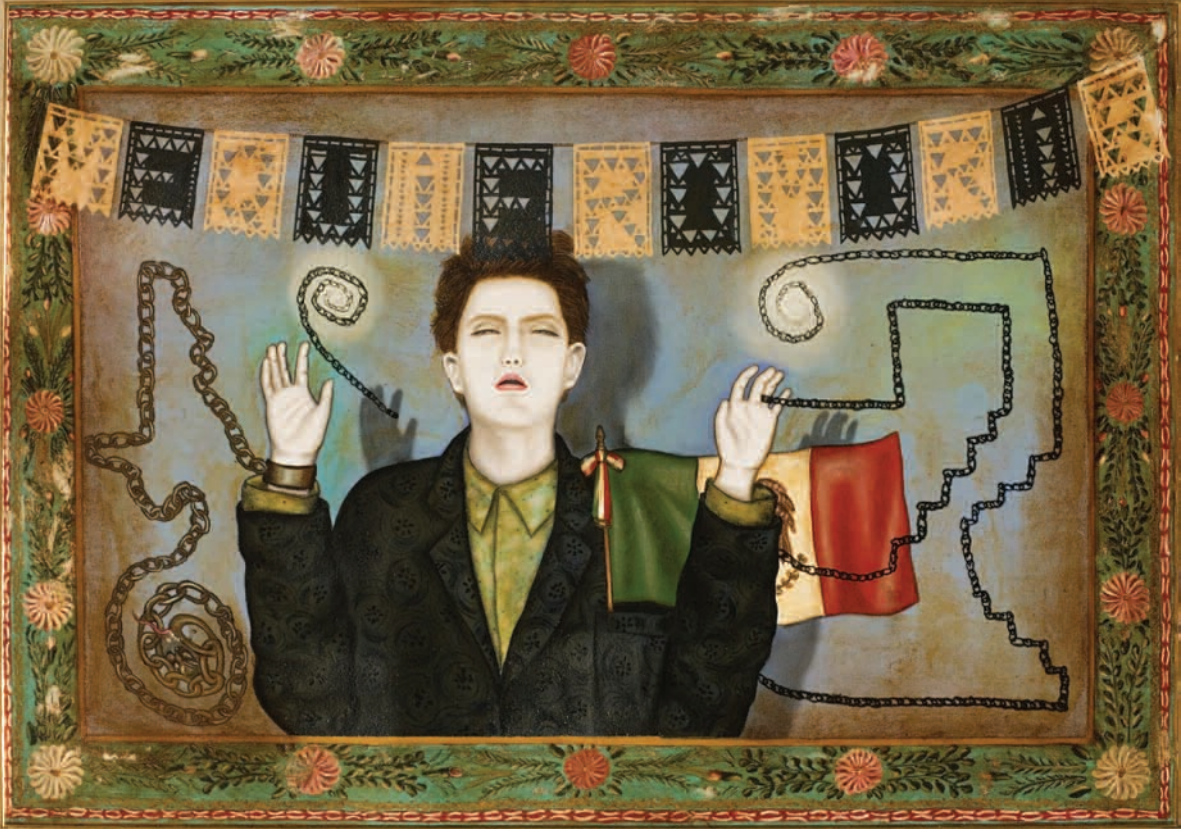
I Want to Die, 132 cm x 187 cm, 1985, private collection (oil on canvas).

of these elements to create his own "miracles": the bright, contrasting colors and even the wear on the tin that they are painted on, which he depicts by scratching the paint on the canvas.