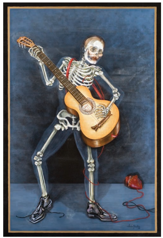
Untitled (Death), 190 cm x 130 cm, 2003, private collection (oil on canvas).

look the same from one portrait to another, from one day to another, from one moment to another, from one way of painting to another, but ever since I was five years old, I've always been this way to survive. And finally, I don't want people to be able to pin me down: I like that mystery.