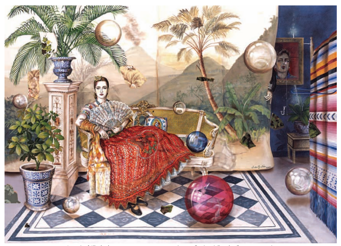
Portrait of Elizabeth, 190 cm x 260 cm, 2000, private collection (oil and collage on canvas).