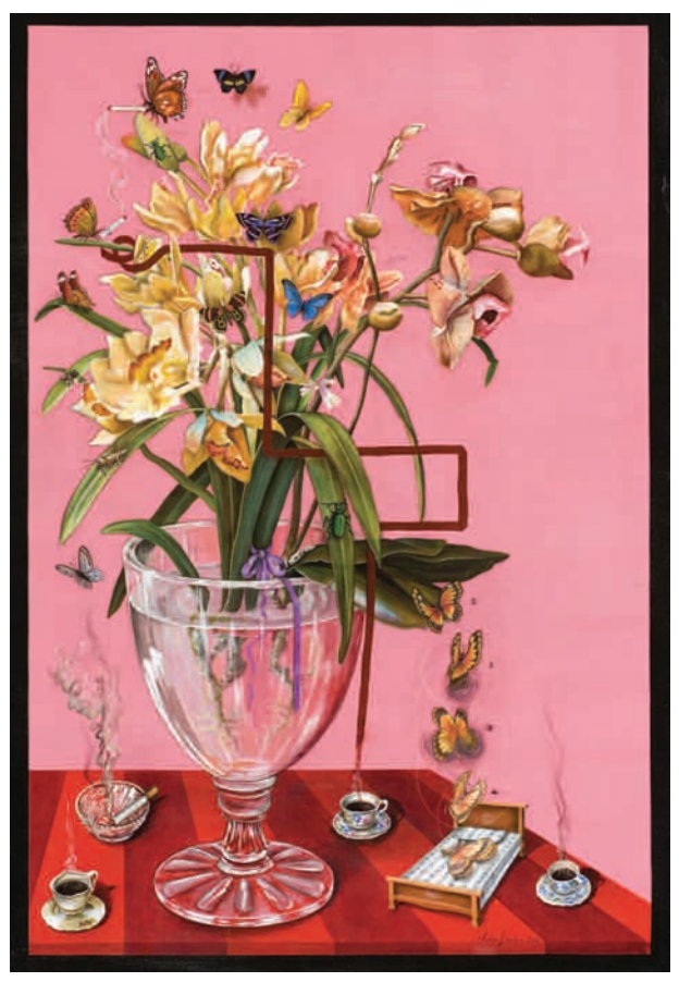
Untitled (Vase), 190 cm x 130 cm, 2003, private collection (oil on canvas).

of barely communicable 'states of being." The artist expresses himself, but it is not his intention to build logical or comprehensible accounts for the viewer. He does not seem to be interested in being understood, either in his life or in his work as an artist. There are no explanations in his painting, and yet, there are constants that make it possible to get a glimpse at the complexity he embodied.