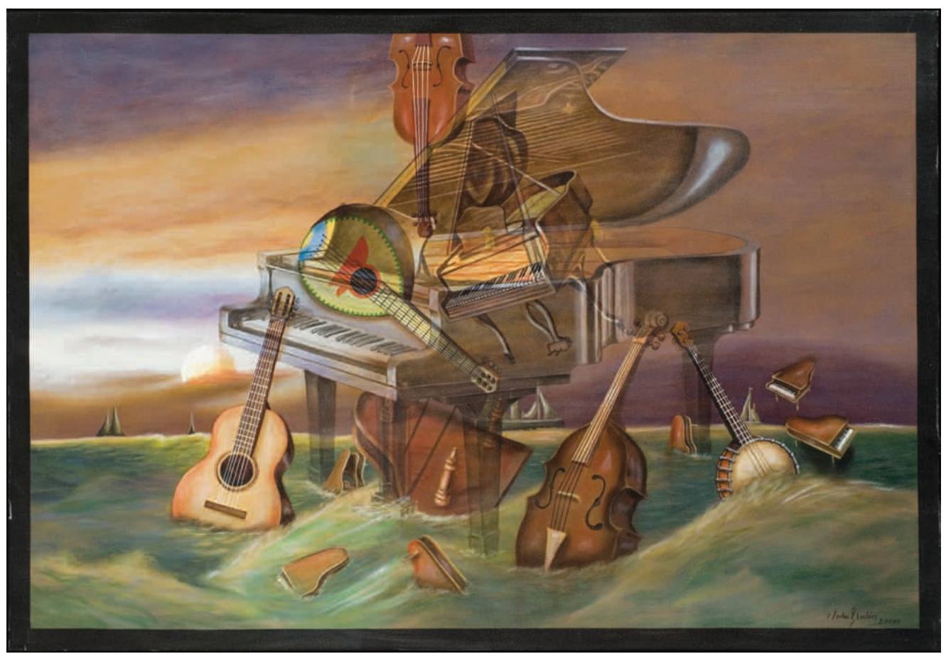
Piano without a Pianist, 130 cm x 190 cm, 2000, private collection (oil on canvas).

I see myself for a moment in a mirror. I have several, and one of them screams as soon as I stand in front of it. The storm gets angrier. A coffer full (emeralds, diamonds, rubies...more diamonds). Can it be mine? JULIO GALÁN