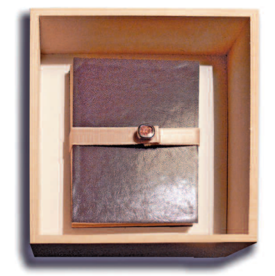
Vivian Galbán Two at a Time 12 x 8 cm, 2008

Nothing more necessary for selling a product than creating consumer desire.