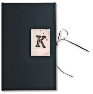
Patricia Lagarde K 33 x 21 x 2 cm, 2007

Shots of a trip to Japan combined with subtle sketches, an encounter with the other. Being on the road is not just a fact, it's an attitude, a permanent window.