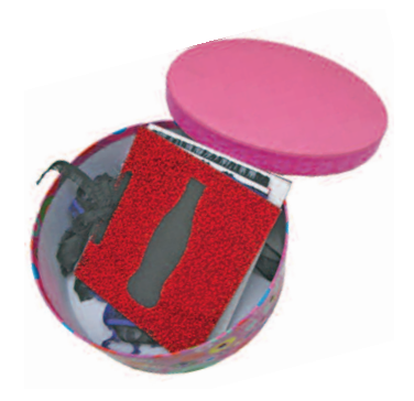
Maia Debowicz Eroticism, Advertising's Hidden Language 18 x 16 cm, 2008.

Nothing more necessary for selling a product than creating consumer desire.