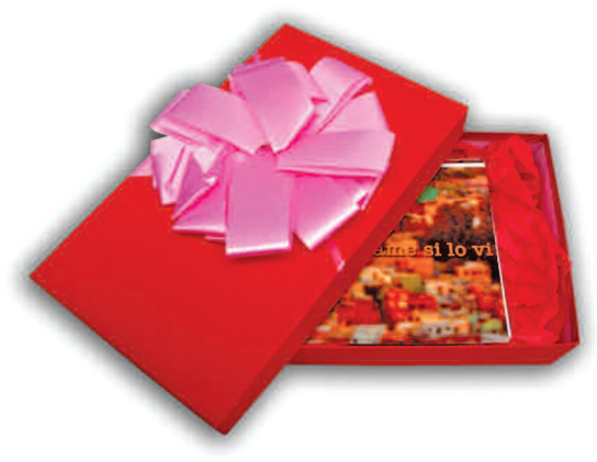
Silvia Castro Ask Me If I Saw It On the Navel of the Moon 12 x 19 cm, 2008.

Fragments of a journey around the Mexico of today.