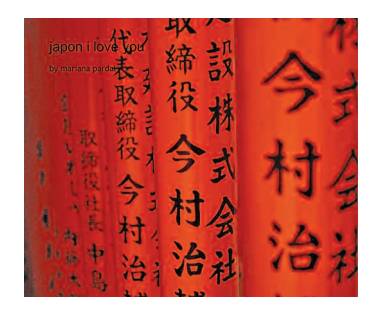
Mariana Pardal Japan, I Love You 20 x 25 cm, 2009.

Stories and mementos of love and its disappointment, its contemporary forms and expressions. Exhibited with other objects in display cases to resemble a "real" museum.