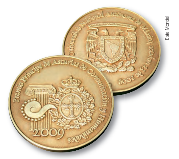
Prince of Asturias Award for Communications and the Humanities 2009, aged bronze , 66 mm in diameter, struck in 2009.

a) Institutional medals, issued to commemorate dates like the foundation of the university in 1910, the anniversary of its becoming autonomous, the 450<sup>th</sup> anniversary of the