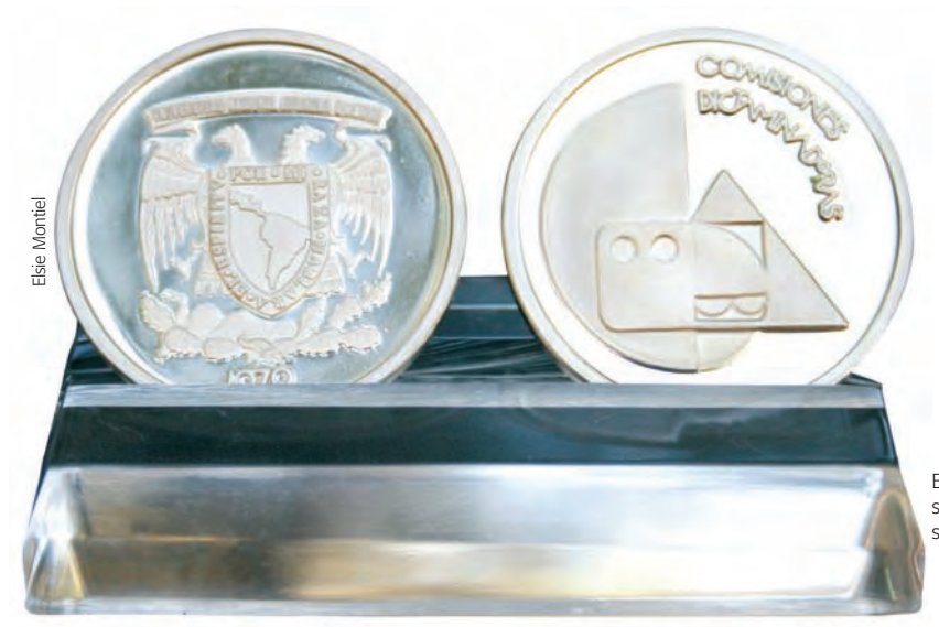
Evaluating Commissions, 999-grade silver, 38 mm in diameter, 40 grams, struck in 1979.