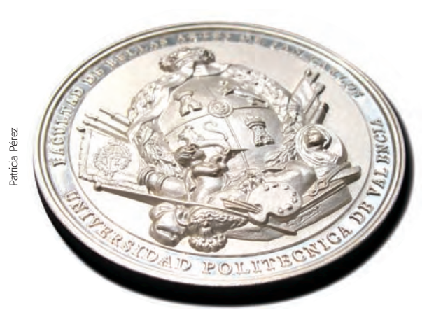
San Carlos School of Fine Arts, Polytechnic University of Valencia, obverse, 999-grade silver, 67 mm in diameter, 150 grams, struck in 1995.

arrival of the first printing press to Mexico, the moment when Congress approved the UNAM charter and the 450<sup>th</sup> anniversary of the foundation of the Royal Pontificate University of Mexico (the UNAM's predecessor). The design of the last two medals was picked from the entries in a competition open to the public.