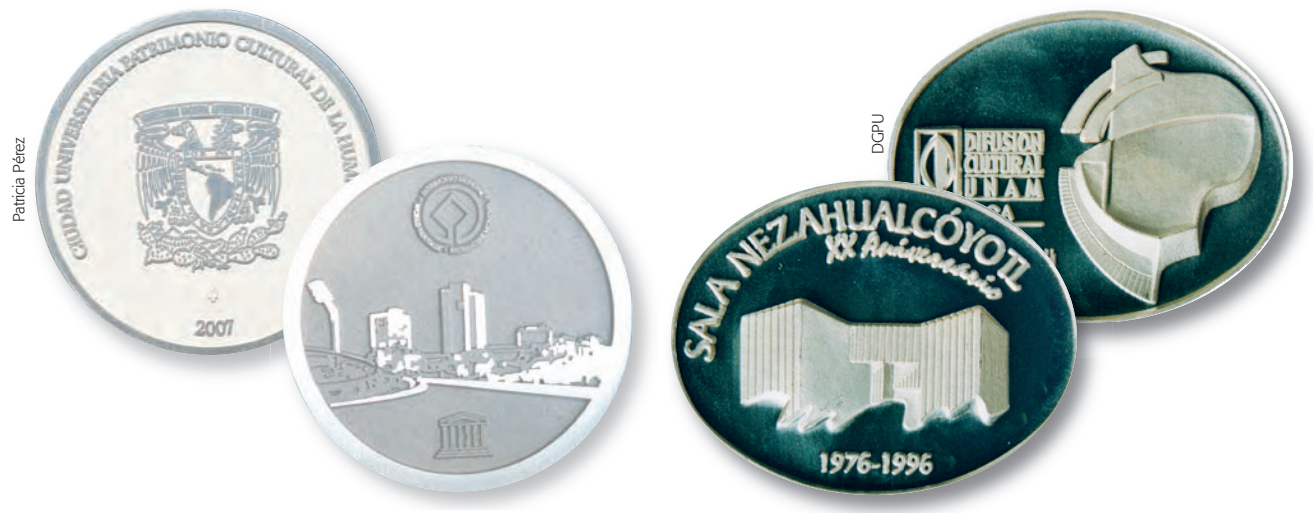
University City, World Heritage Treasure, 999-grade silver, 60 mm in diameter, 100 grams, struck in 2009.