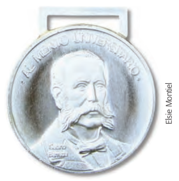
Gabino Barreda Medal for University Merit, obverse (given to the student with the highest grade-point average in his/her high school or college graduating class), 999-grade silver, 40 mm in diameter, 38 grams, struck in 1982.

to completely innovative images showing the evolution of numismatics. The forms go way beyond traditional round medals, to elliptical, square, rectangular, hexagonal, heptagonal, octagonal and decagonal. One interesting point is that the collection has not been gathered for exactly artistic reasons, which is why the pieces are never on display. And, although publications do exist that catalogue their aim, appearance and year of issue (like the one this article is based on), as a collection, the holdings are almost completely unknown both among members of the university and the Mexican public in general.