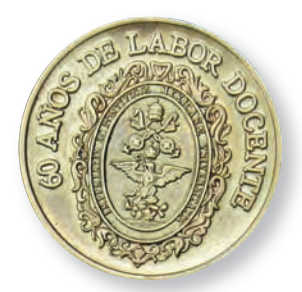
60 Years of Academic Service, obverse (coat of arms of the Royal Pontifical University of Mexico), 24-carat gold, 33 mm in diameter, 20 grams, struck in 1992.