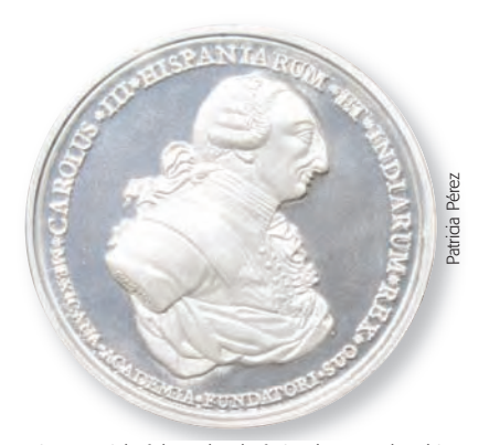
Bicentennial of the School of Visual Arts and Architecture (Carlos III Medal), 999-grade silver, 67 mm in diameter, 150 grams, struck in 1982.