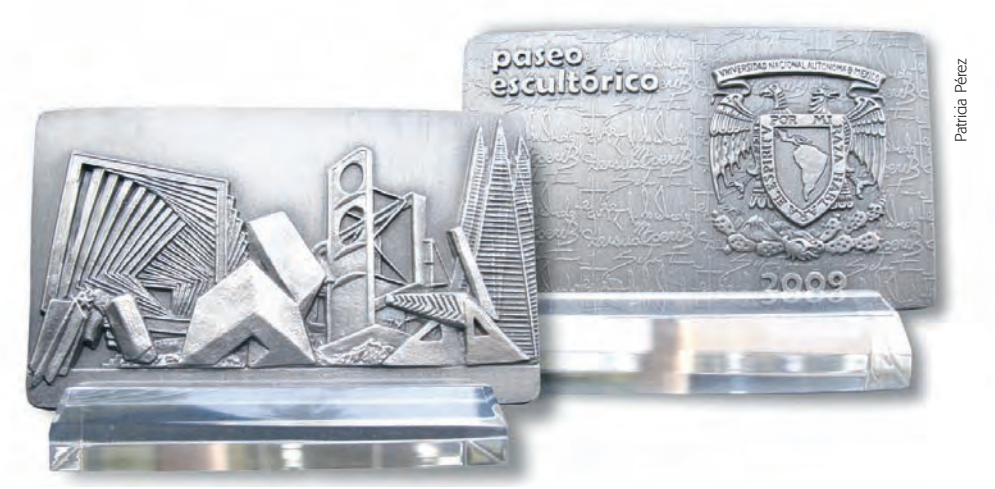
30 Years, UNAM Sculptural Walk, electrolytic pewter, 100 x 60 mm, struck in 2009.

The university's old medal collection, stored at the San Carlos Academy, dates back to the end of the eighteenth century, even though the Mint began striking medals in New Spain in 1536 for the Royal University of Mexico. With the arrival of Gerónimo Antonio Gil to these shores in 1778, steps were taken to organize a school for engravers at the Mexico City Mint (1781), the precursor for the San Carlos Royal Academy of the Three Noble Arts (1785) in New Spain. The relationship be tween the Mint and San Carlos was established thanks to the interest of Gil, the mint's greatest engraver, in education.