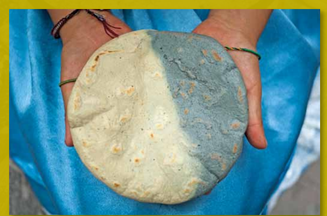
Two-colored tortilla, made from both blue and white corn.

By obtaining this distinction, we are making a commitment to the UNESCO to preserve and promote our gastronomy, not just in Michoacán but throughout Mexico.