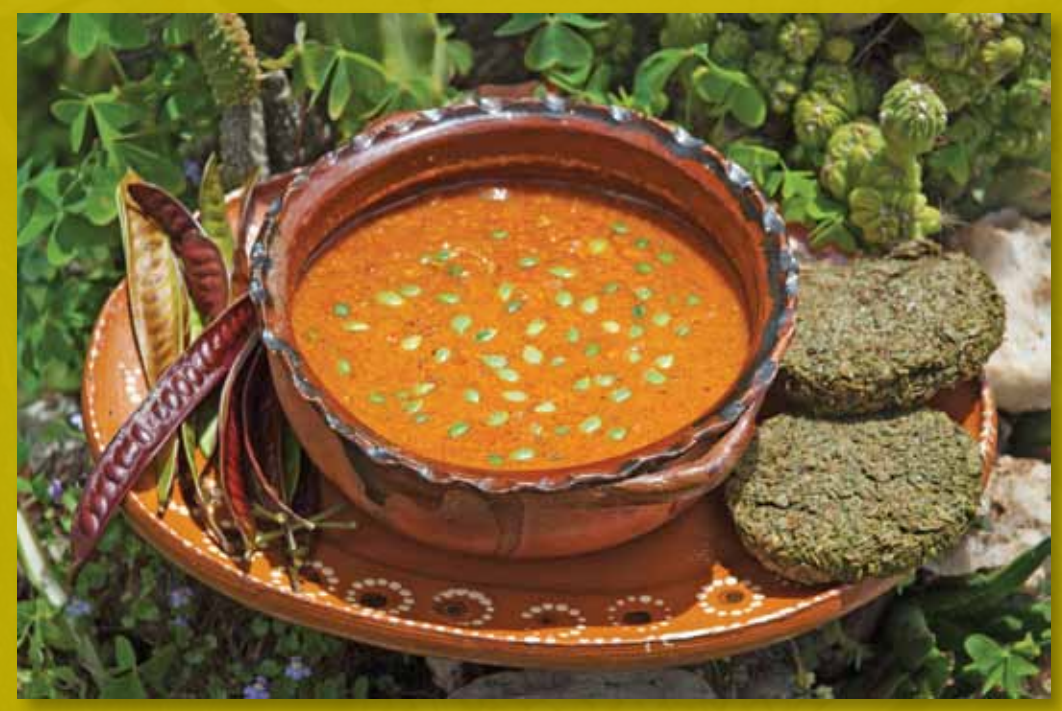
Guasmole, a dish made using the legume called guaje

Mexican cuisine has been influenced by the land where it has developed. Mexico is a region of huge biodiversity, a place where various elements combined to encourage original ways of preparing food.