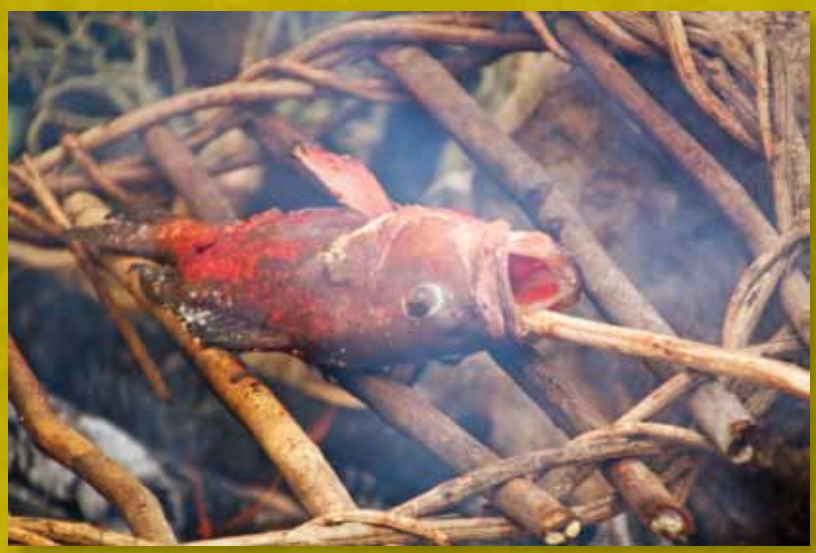
Roasting over an open wood fire is a lasting tradition.

GLM: I completely agree; cultural manifestations are never static and cannot be carved in stone. That's why it's a living culture in constant evolution. Placing traditional Mexican cuisine on the UNESCO's intangible heritage list does not at all mean inhibiting its natural and unavoidable