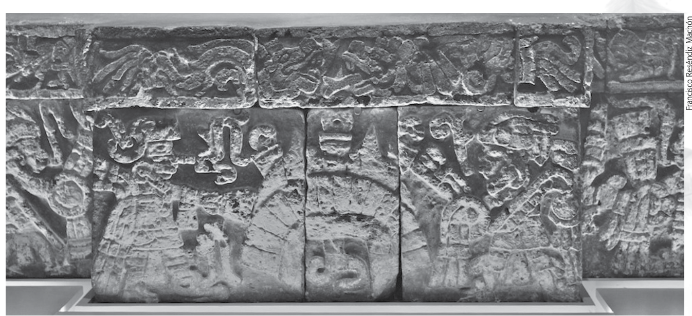
Mexican bench from the Templo Mayor (High Temple) site, National Museum of Anthropology and History.

es flew together through the air . . . and made little girls and boys sick." ^{10}