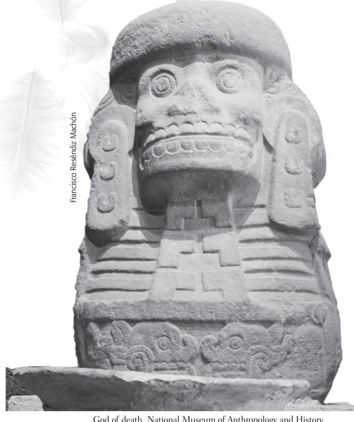
God of death, National Museum of Anthropology and History.

The cihuapipiltin could visit the earth, transformed into skeletons with livid faces, the claws of a rapacious bird, and dressed in lace decorated with bones. "These goddesses flew together through the air . . . and made little girls and boys sick."