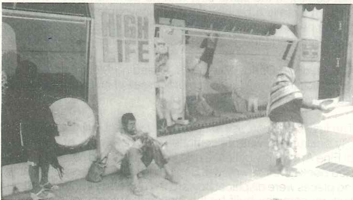
New arrivals earn a living in Mexico City.

are most obvious. Nonetheless, according to Carlos Monsiváis, there is still solidarity in the city, despite the enormous psychological damage implicit to life in such a chaotic and closely-packed environment. "It would seem," he explains, "that life is just like it is in any other big city. But I don't think that's really true; we still haven't reached the degree of indifference, reserve and rejection that marks life in major, Western urban centers. In Mexico City peasant culture and old-time workers' culture still have a certain importance, and we have yet to get to the point of total isolation and rejection of our neighbors; I think we're not there yet. Everyone in the Federal District shares the hardships and lives in a climate of perpetual tension and anxiety, yet people still find time to maintain some minimal forms of communal life, to continue as best they can the classic traditions of family, friendship and compadrazgo .* On the one hand, it is a city of 18 million people, representing a completely new phenomenon in the world, yet at the same time people hold on tightly to traditional social forms."