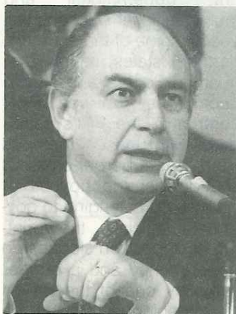
Miguel González Avelar

President De la Madrid himself demanded mutual respect and cooperation from his cabinet members, among whom his successor will most probably be chosen. His call came at a very peculiar