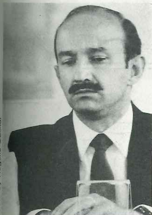
Carlos Salinas de Gortari