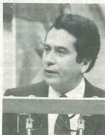
Alfredo del Mazo