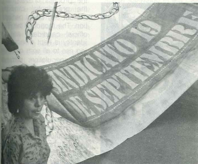
In the front line of feminist struggles, seamstresses at a demonstration

Not needing an organized struggle to improve one's own living conditions has resulted in a very theoretical movement. This is revealed by the fact that being a feminist in Mexico is basically an intellectual position, with little effect on our daily lives. This characteristic also probably determines our incapacity—as a movement—to connect up with women from other social sectors. This trend has changed somewhat following the earthquake in Sept. 1985, but generally speaking, even