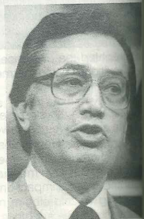
Manuel Bartlett Díaz

discussion. On the left the situation is different. Fed up with the sectarianism that for decades has kept the left from uniting and gaining ground, five political groups have decided to form "a single party (in an attempt to) change Mexico's political regime and to open broad avenues so that workers and the people in general may take part in national affairs, and in order that the country may recover from the 'historical breakdown' it has been led into." The Unified Socialist Party of Mexico, PSUM, the country's third electoral force, will fuse with the Mexican Workers' Party, PMT, the Patriotic Revolutionary