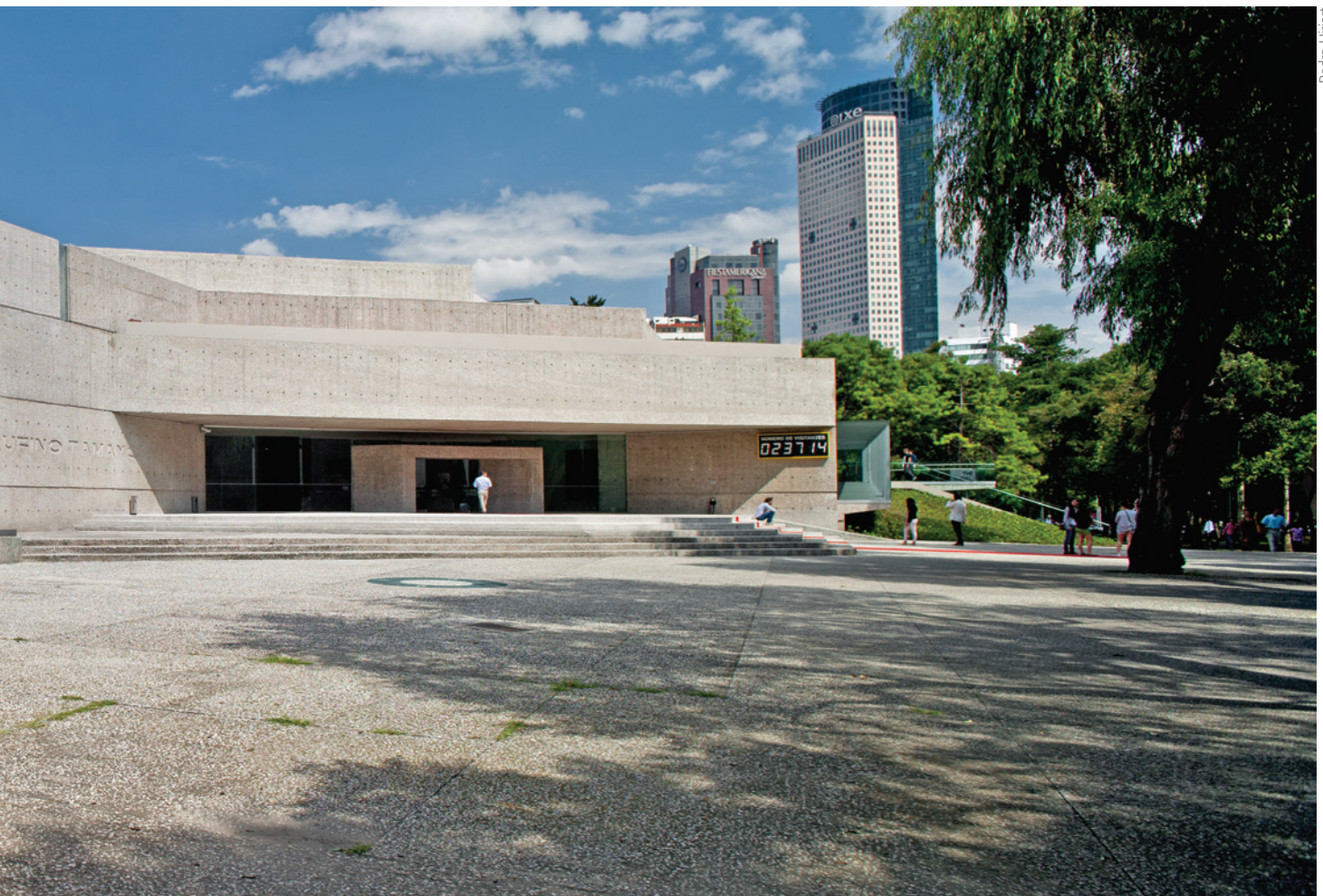
▲ Teodoro González de León and Abraham Zabludovsky, Rufino Tamayo Museum, Mexico City, 1981. Remodelling and Expansion by Teodoro González de León in 2012.

Architecture only comes alive when it is lived in, when it is walked through and enjoyed; when it becomes beloved and dear to us.