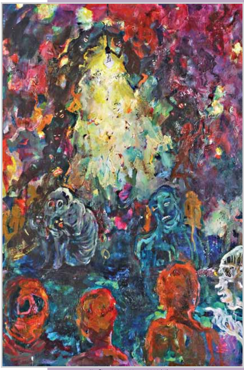
▲ Fireflies, 120 x 100 cm, 2016 (oil on canvas).

Examining Vidales's oeuvre offers multiple aspects to choose from. One of the most obvious is perhaps the grotesque, not so much in her style as in an aesthetic that questions the hegemonic cannon of representation.