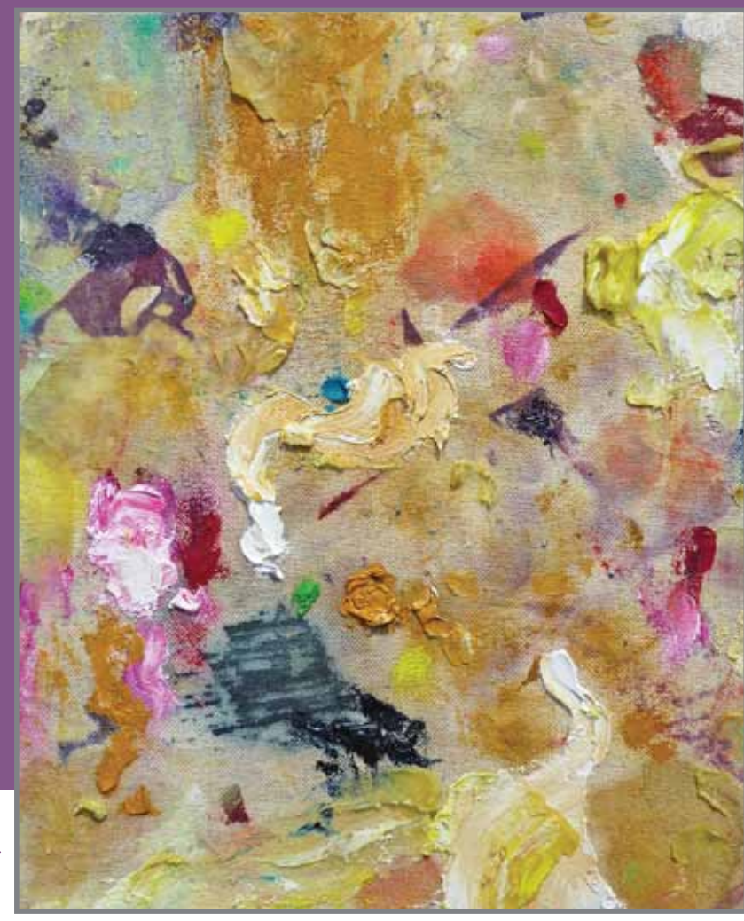
Accumulations, ▶ variable sizes, 2016 (oil and encaustic on wood).

If we look closely at Vidales's canvases, it is very noticeable that they are dealt with not only as material, but also as a result of a multiplicity of contradictions that question the "right" or "pure" way of producing and appropriating art.