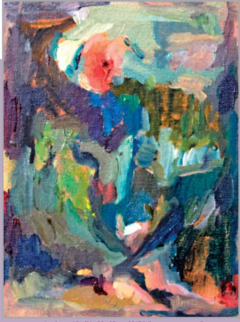
▲ Landscape Like Skin, 30 x 25 cm, 2017 (oil on canvas on wood).

Vidales asks herself about the possibilities of painting beyond the canvas. These reflections, she says, are part of a still-unnamed project that seeks to bestow this material with a kind of body and turn it into a three-dimensional object constructed using what she calls "waste" or "scraps"; that is, the remainders of other paintings, pieces of acrylic or oils that, when manipulated, form irregular bodies, kinds of eyes, intestines, and mouths, adhered to windowpanes like stickers, or that are stuck together like different layers of translucent, multi-hued skin.