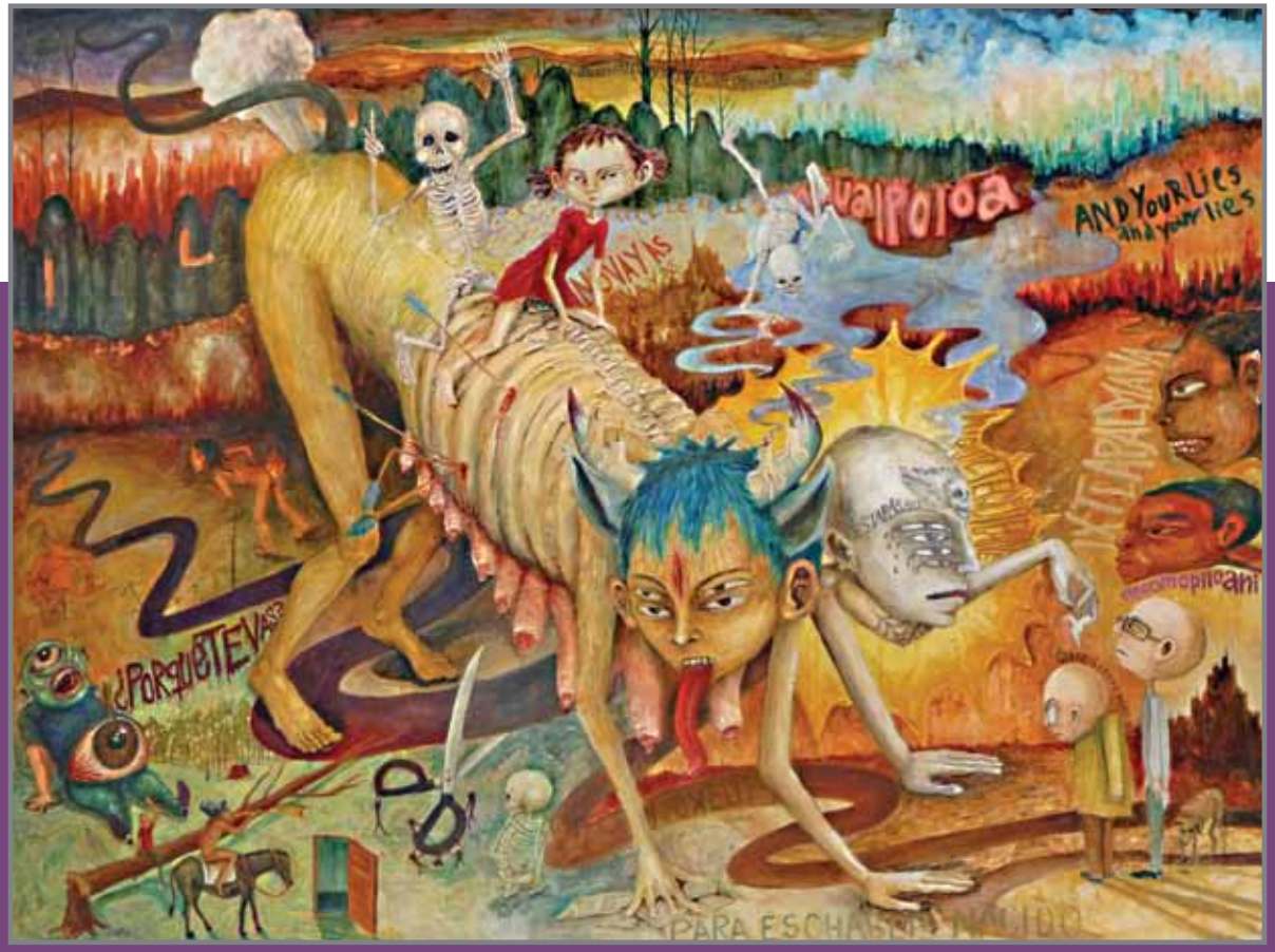
The Path of Contradiction, 150 x 240 cm, n.d. (oil and encaustic on wood).

The artist's emphasis on color is one of the fundamental crosscutting themes of her work. If we look closely at her canvases, it is very noticeable that they are dealt with not only as material, but also as a result of a multiplicity of contradictions that question the "right" or "pure" way of producing and appropriating art in general and painting in particular. Vidales says, "Perhaps those colors that have been called pure . . . are that weightless light that goes from the grasses to the fire and from the fire to the clouds, with no weight or roots." However,