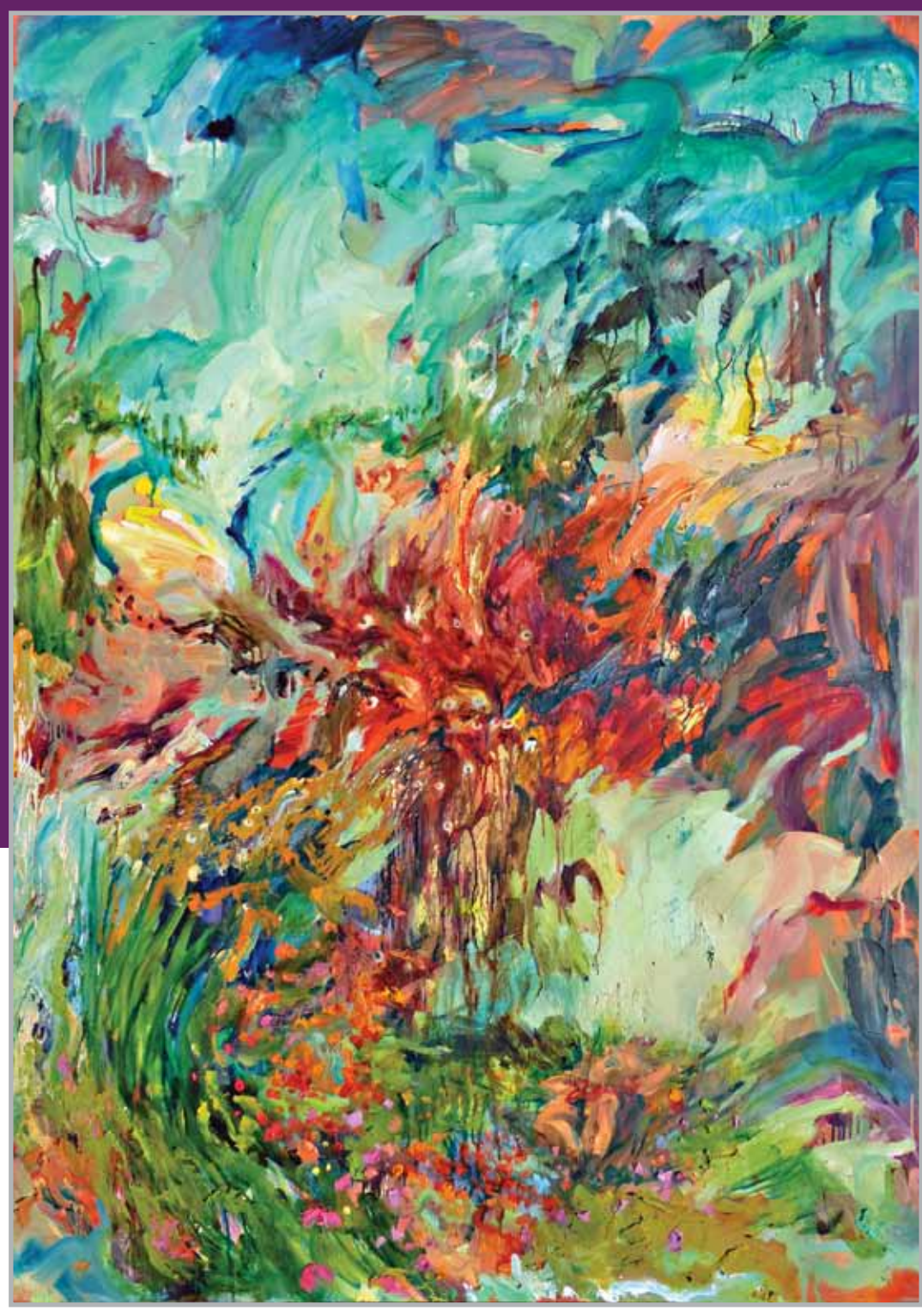
▲ I Thought I Shouldn't.

In her canvases, the paint becomes a living material: the density of its layers of color has the necessary vitality that the artist raises in a singular fashion through a series of relationships, tensions, and questions that make her work a place in which depth overflows, becomes light, and ascends.