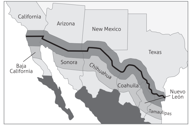
Figure 1. States of the Mexico-U.S. Border Region

So, one of the United States' most important relationships is with Mexico, its third trade partner after China and Canada; the second-largest destination for its exports;