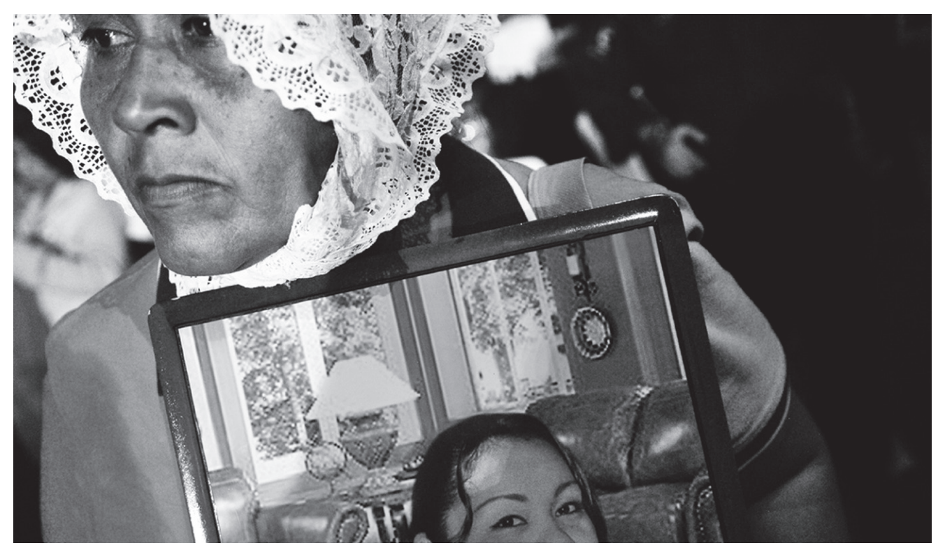
Central American mother, looking for her disappeared migrant daughter.