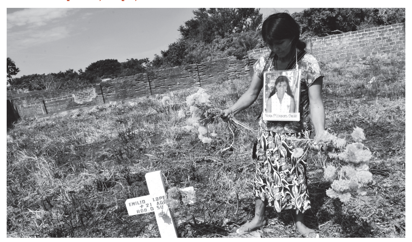
Thousands of migrants disappear along Mexico's routes. Here, a mother in search of her daughter puts marigolds on a mass grave in the cemetery.

money. I also need to go to the Quiaca border between Bolivia and Argentina and to the triple border joining Argentina, Brazil, and Paraguay.