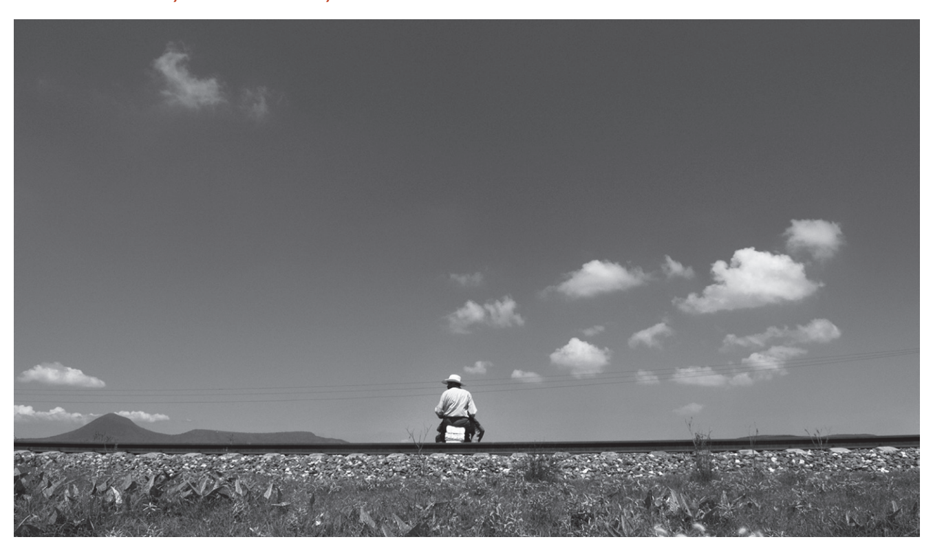
A solitary man waits for the train to continue the road to the Norte . His only possession: hope.