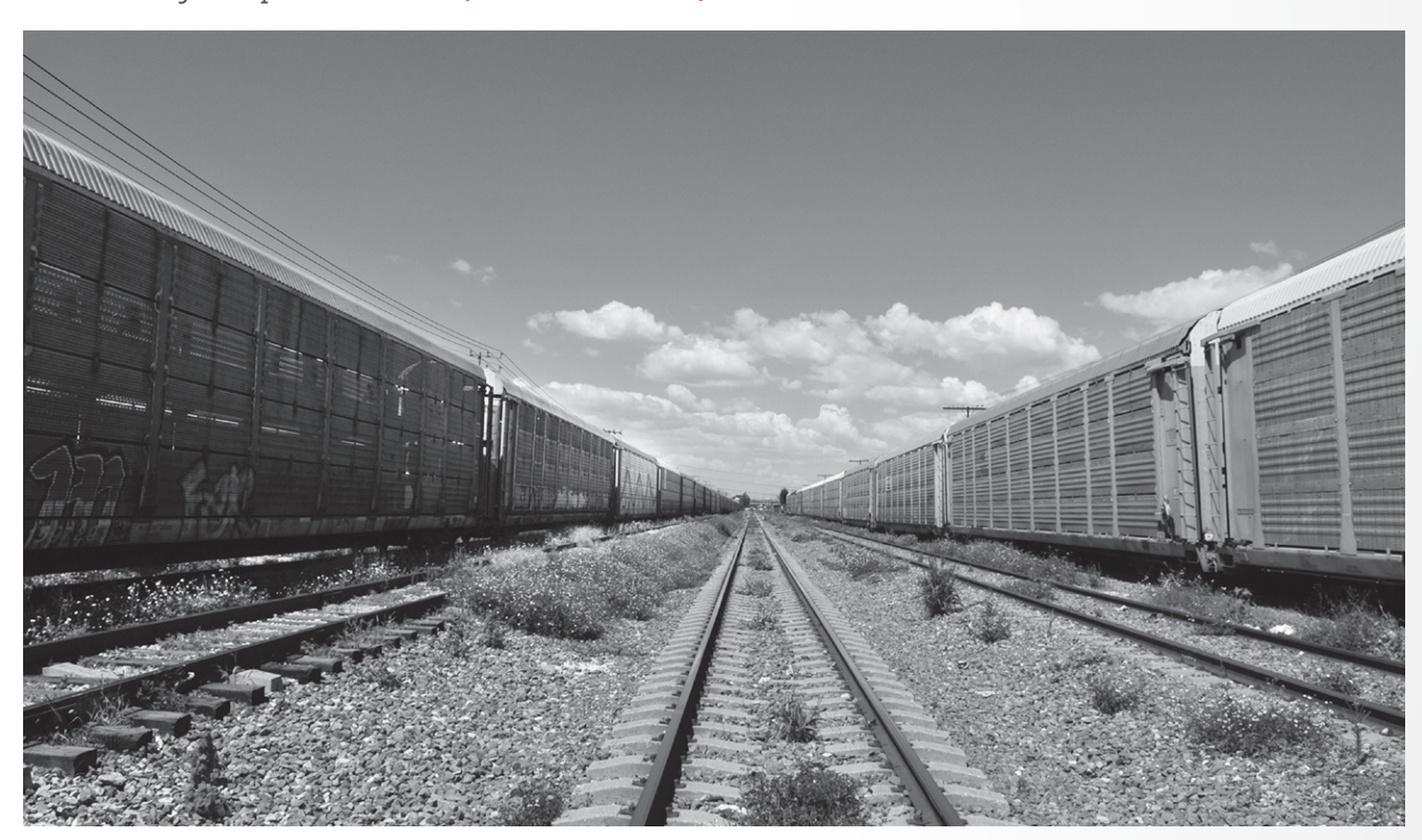
At least three migratory routes cross Mexico from south to north: uncertain spaces, full of the most unimaginable dangers.