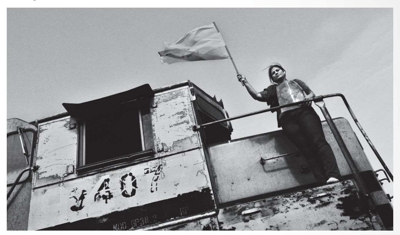
Atop the train known as "The Beast," this mother is traveling in search of her daughter, presumed to have been kidnapped on the Mexico-Guatemala border to work in a prostitution ring.

waiting to carry out the verdict surreptitiously, illegally handed down in an underground city located under the airport, where thousands of migrants will be deported and where they wait, rubbing elbows with their captors, their judges, and their executioners.