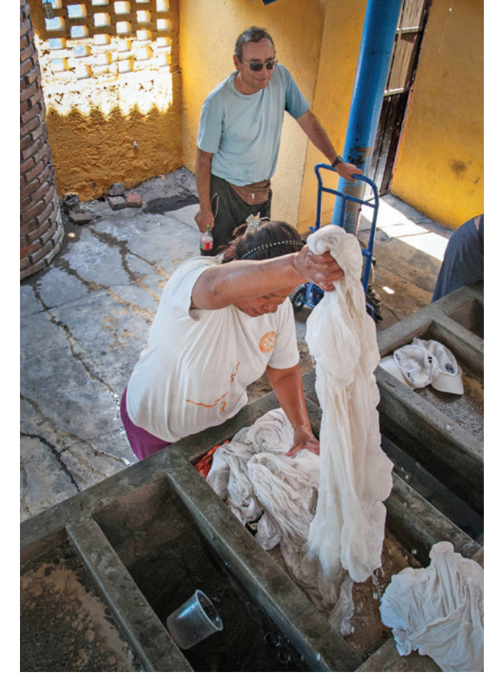
In addition to the clothing, troubles are also scrubbed here. The women insist that washing helps them clear their minds.