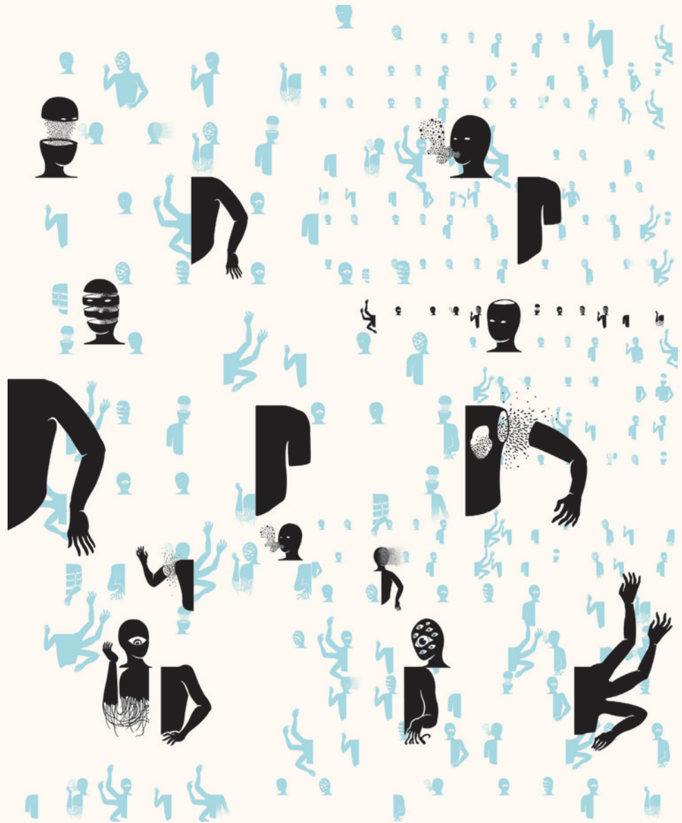
Ilustración: Rubén Chumillas

¡Encuéntrala en librerías! Suscríbete: (55) 55505800 suscripciones@revistadelauniversidad.mx www.revistadelauniversidad.mx @revista_unam