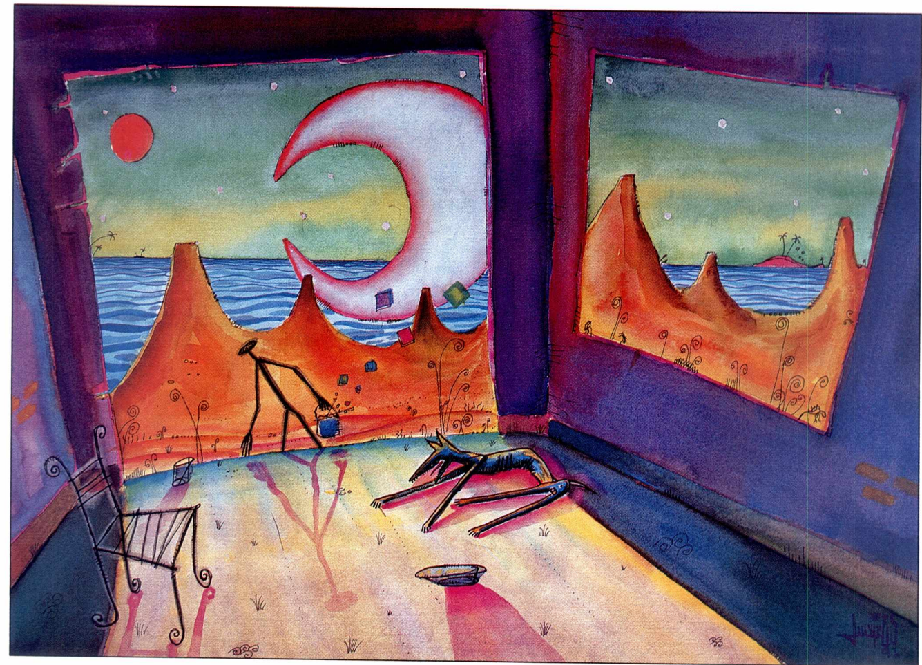
Jorge Santana, Fish Palate, watercolor and ink on paper, 1992.

The end of Tiempo lunar is anticlimactic. Andrés' cycle of searching comes to a close and it becomes patently obvious that everything has been a representation. From a distant point of view, the reader's questions can be extended. Woman tempts man and captures him for a moment. Man sneaks away and wonders why females can never be captured, despite being seduced or raped (in one chapter of the novel, Andrés rapes Milena). The search never ends, the novel remains