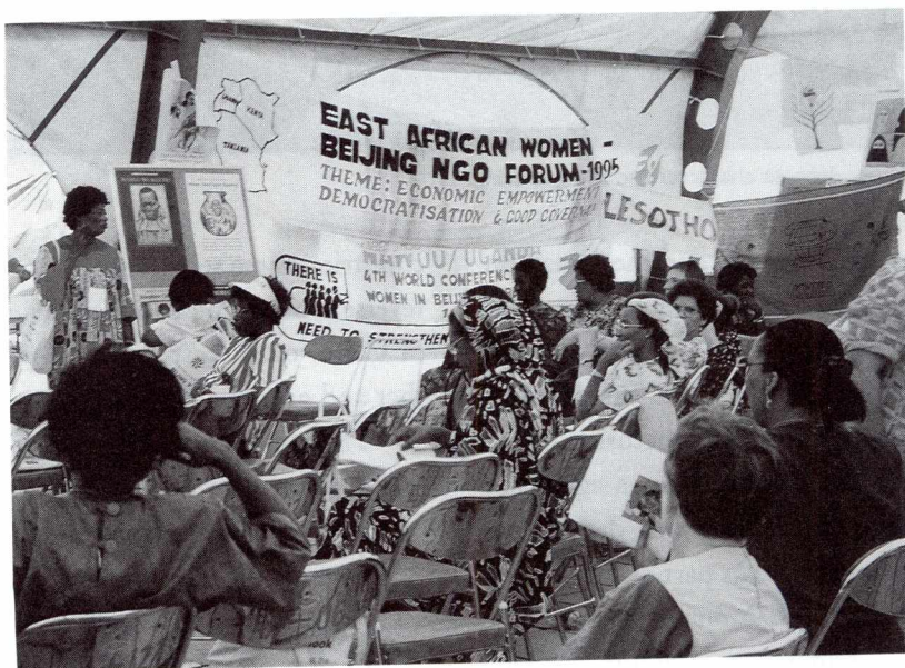
One of the Forums at the Conference.

For its part, the Governmental Conference was the culmination of a vast amount of preparatory work, carried out all over the world over the course of three years. International women's organizations had mobilized, moreover, to ensure that their demands and interests would be included in the documents approved at the five previous meetings (on childhood, in New York; human rights, in Vienna; the environment, in Rio de Janeiro; population, in Cairo; and social development, in Copenhagen). In Beijing they hoped to move forward in terms of the commitments made previously.