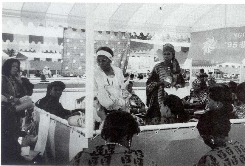
Lively debates characterized the gathering.

ment programs and the transition to market economies in some countries, the growth of poverty, as well as such issues as aid for development and the restructuring of the United Nations. Thus, a significant amount of time was devoted to these themes as part of the debates prior to and during the Conference.